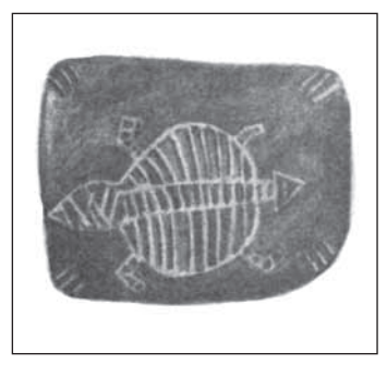
Incised stone tablet

Miniature pottery vessels with tabs on the rim and with decorative elements such as deeply incised spiral grooves encircling the body from base to neck, incised animals and birds.