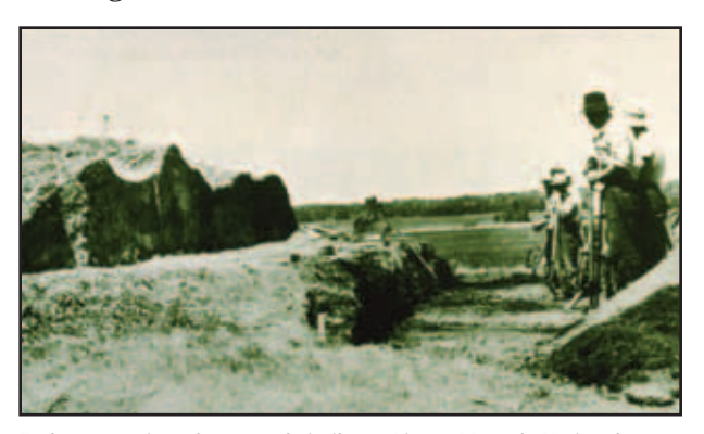
Early excavation of a mound similar to Linear Mounds National Historic Site of Canada

The main mounds are two low earthen embankments each almost 200 metres in length, and terminating in circular mounds at either end. They are situated on a promontory overlooking the Antler River. One feature aligns north south, while the other lies east west, and extends beyond Parks property into an adjoining field. An elliptical mound also occurs on the property. The mounds are scarred by traces of relic hunting, and of archaeological investigations conducted in 1907, 1913 and 1914