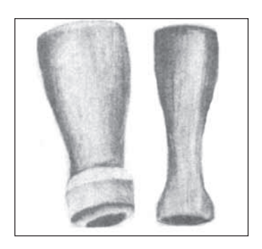
Tubular stone pipes

• Tubular stone pipes, beads and other objects fashioned from exotic raw materials such as catlinite and native copper.