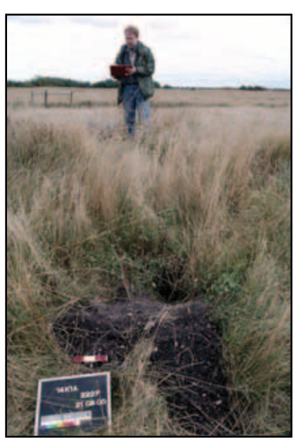
Periodic monitoring is undertaken to assess disturbance and deterioration

Linear Mounds is administered by Parks Canada under the Historic Sites and Monuments Act. The site is managed by the Manitoba Field Unit office in Winnipeg and a monitoring strategy was developed and implemented for the site in 1994. This includes a visual inspection by walking the entire site as well as a photographic comparative analysis of the mound features using fixed points of reference, to determine if changes are occurring. Parks Canada previously had a small contract with an adjacent landowner for minor annual maintenance, however, in recent years this has been discontinued.