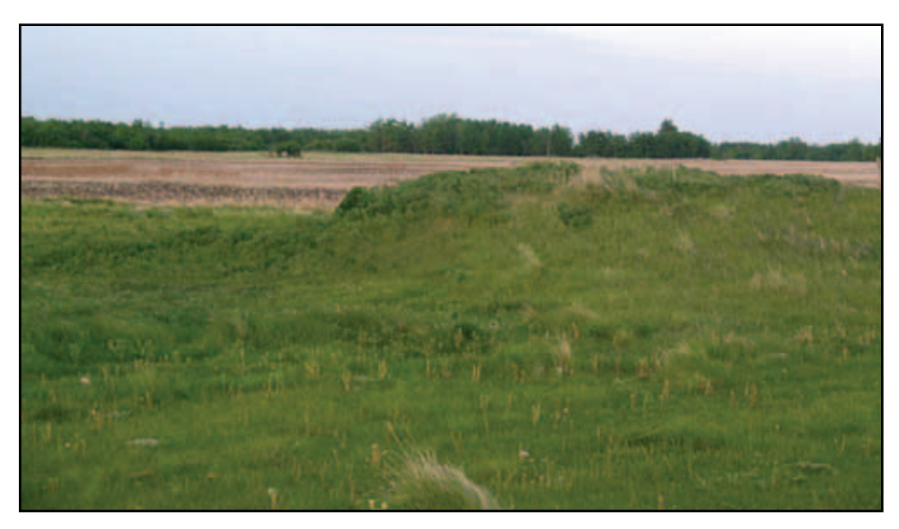
Circular terminus at the south end of one of the Linear Mounds