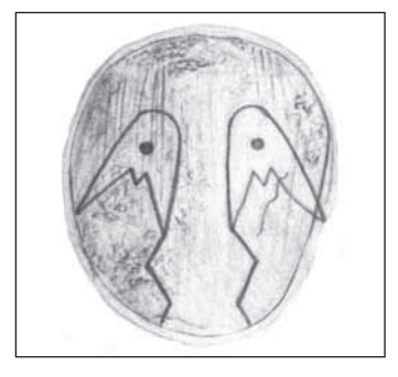
Gorget marine shell

• Tubular stone pipes, beads and other objects fashioned from exotic raw materials such as catlinite and native copper.