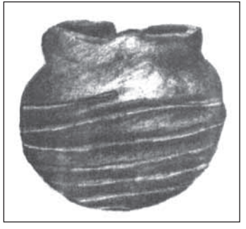
Incised spiral pottery vessel

Miniature pottery vessels with tabs on the rim and with decorative elements such as deeply incised spiral grooves encircling the body from base to neck, incised animals and birds.