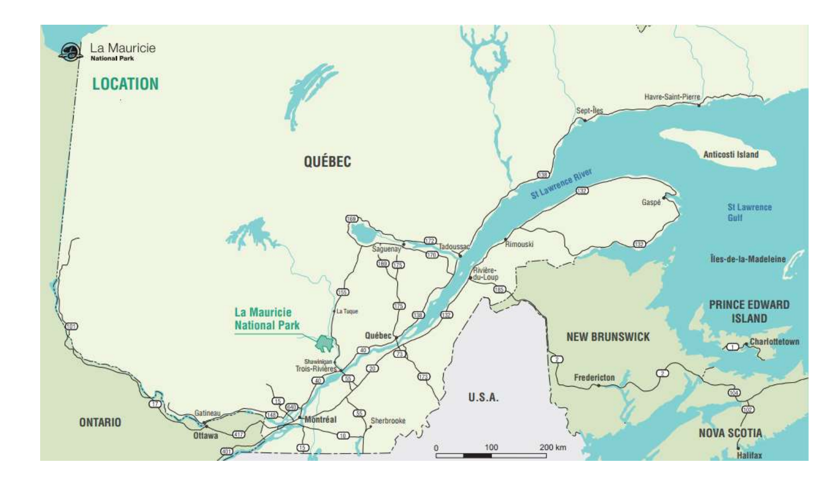
Map 1: Regional Setting