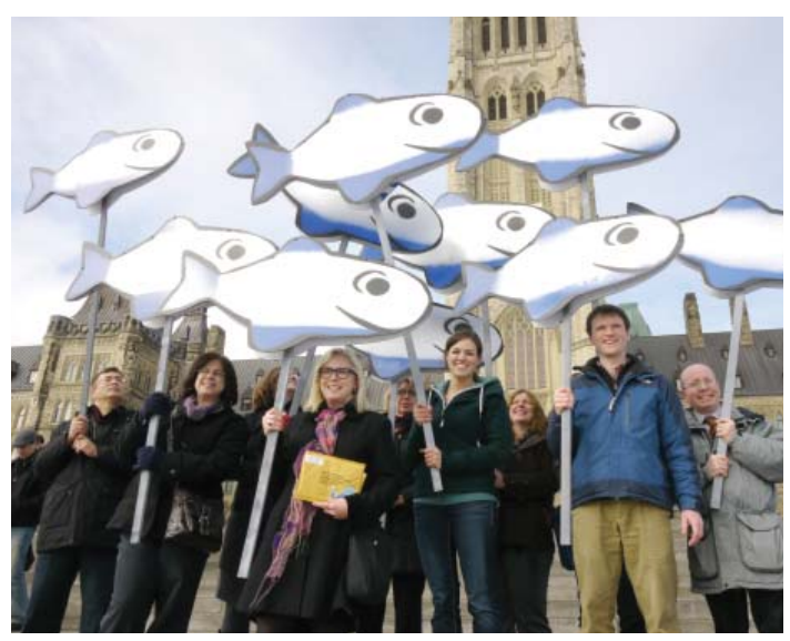
CPAWS is joined by some "fishy" friends on Parliament Hill in March to present the names of more than 16,000 people who called on governments to establish 12 new marine protected areas by the end of 2012 to the Minister of Environment and Minister of Fisheries and Oceans.

Since launching our Dare to be Deep campaign in 2011, more than 16,000 people signed on to support the establishment of 12 new marine protected areas in Canada by the end of 2012. In our final progress report released earlier this year, we noted significant progress on four of the sites, no progress on another four, and only some progress on the remaining four. Of the 12 sites we identified, not one had received final legal protection. The struggle continues!