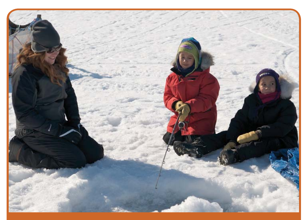
Canadian Olympic heroine Clara Hughes learns how to ice fish during a visit to the village of Lutsel K'e at the east arm of Great Slave Lake in April as part of CPAWS' campaign in support of permanently protecting Thaidene Nene, Canada's newest proposed national park in the NWT.