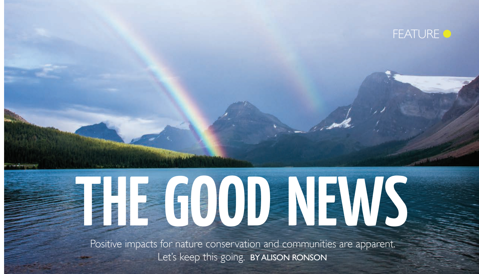
Double rainbow over Bow Lake in Banff National Park, Alberta.