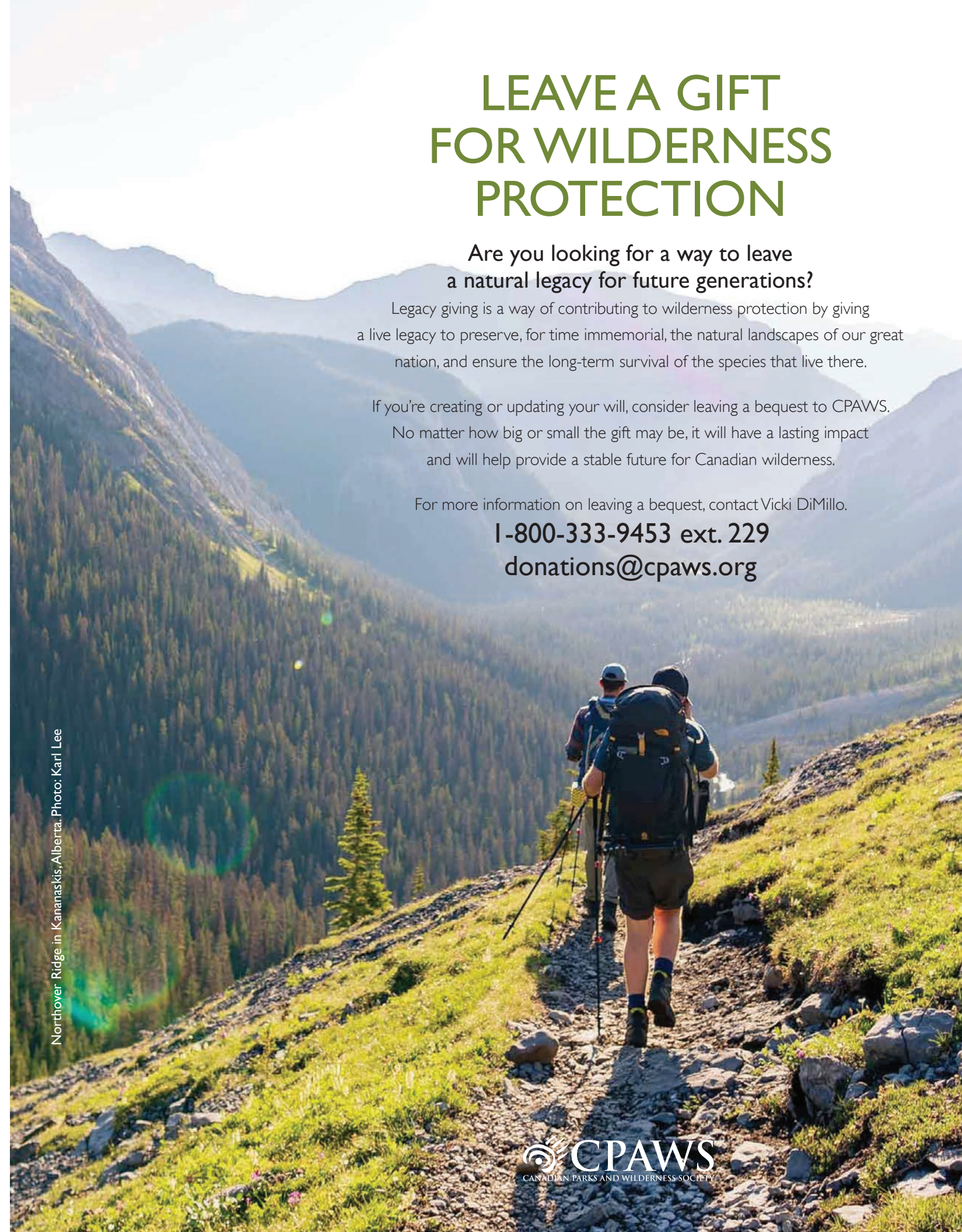
Northover Ridge in Kananaskis, Alberta.

1-800-333-9453 ext. 229 donations@cpaws.org