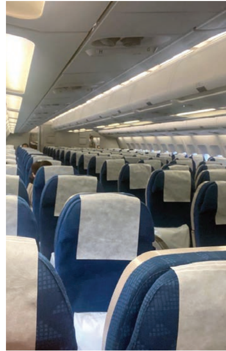
Scenes from a conference: The Roman Forum was empty. The airport was empty. Two weeks later, most of Canada was going into lockdown as the virus swept through our country too.

As Canadians tried to cope with the stress of the pandemic and self-isolation, they flocked to parks and green spaces, seeking solace in nature. It's obvious COVID-19 has reinforced that nature is a core Canadian value, that parks and protected areas are an essential service, and that we urgently need more of these natural spaces.