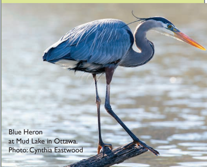
Blue Heron at Mud Lake in Ottawa.