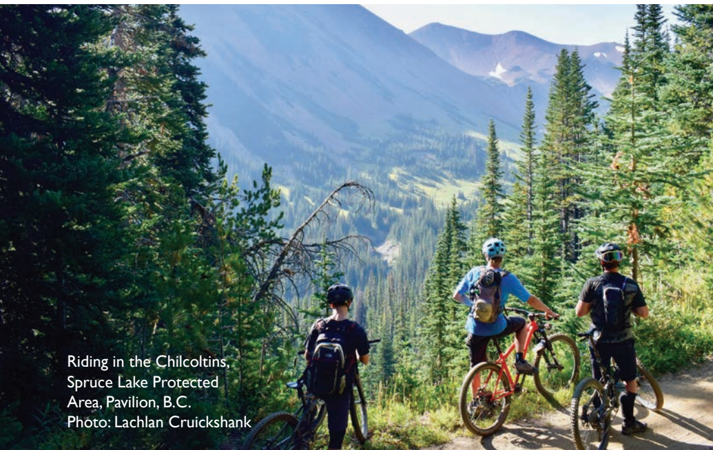
Riding in the Chilcoltins, Spruce Lake Protected Area, Pavilion, B.C.