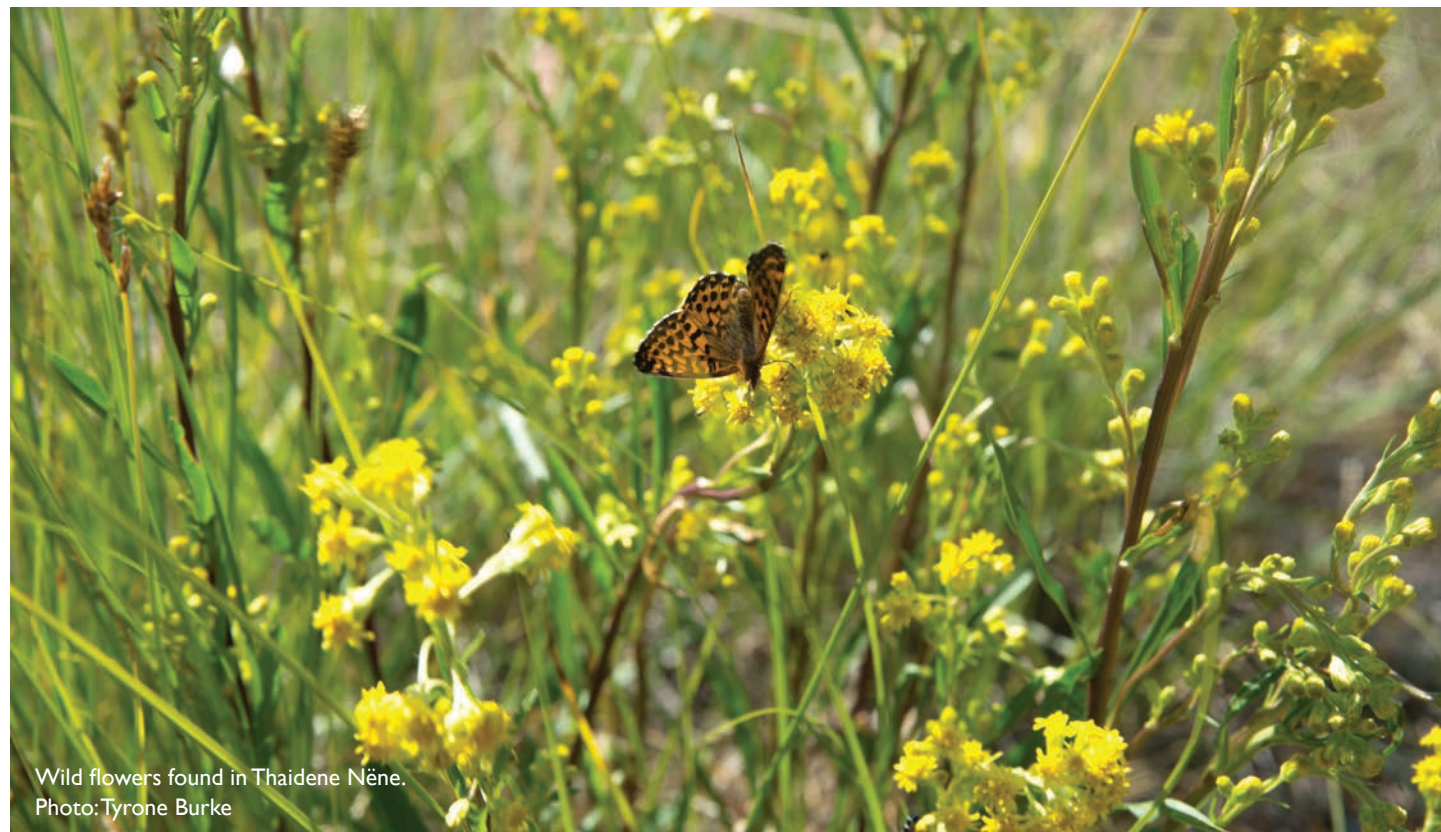
Wild flowers found in Thaidene Nëne.

This program enabled us to team up with 8 seniors in the Edmonton-area to develop an outreach program that specifically speaks to seniors on how to become actively involved in local environmental issues. Ambassadors have contributed by attending outreach events, collecting hundreds of signed letters in support of headwaters protection, and connecting CPAWS staff with networking opportunities. The program works to create avenues for retirees to take part in conservation work, while tapping into their wealth of knowledge and expertise.