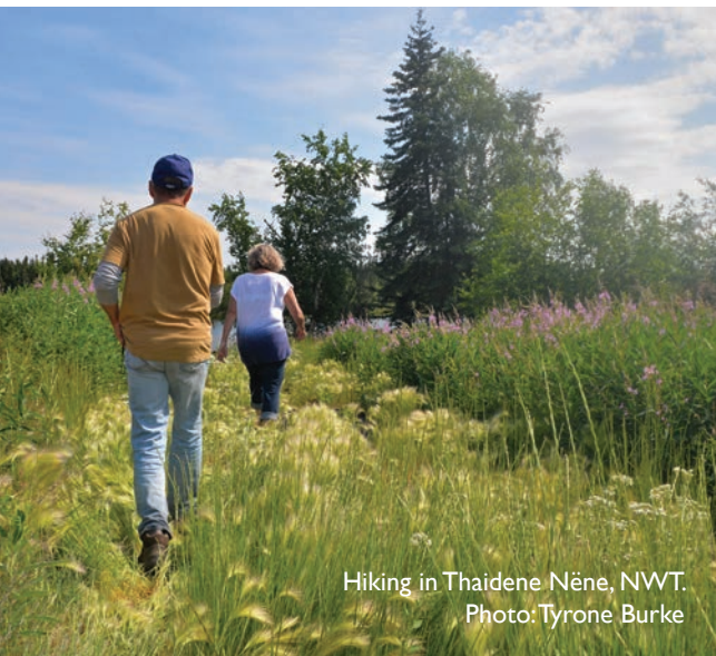
Hiking in Thaidene Nëne, NWT.