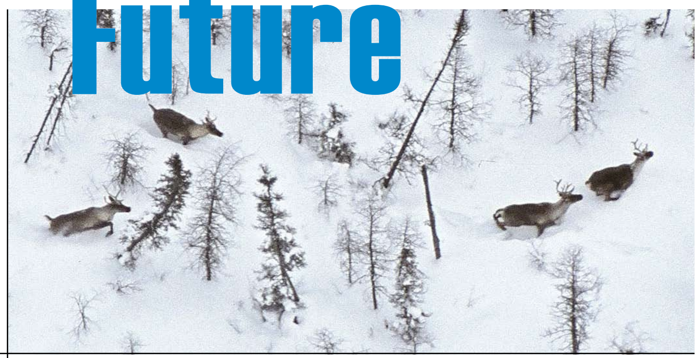
Woodland Caribou and Canada's Boreal Forest