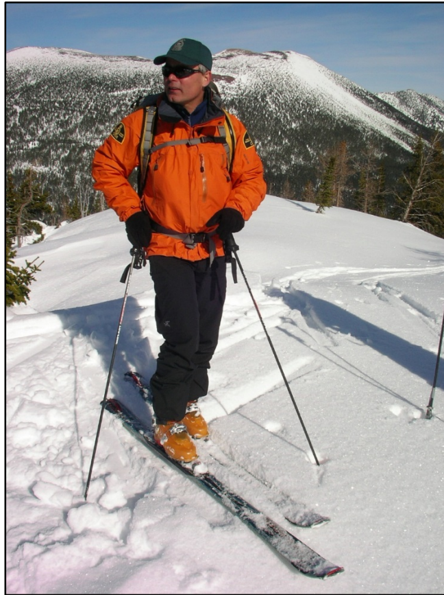
Wall – Forum Divide, February 2008