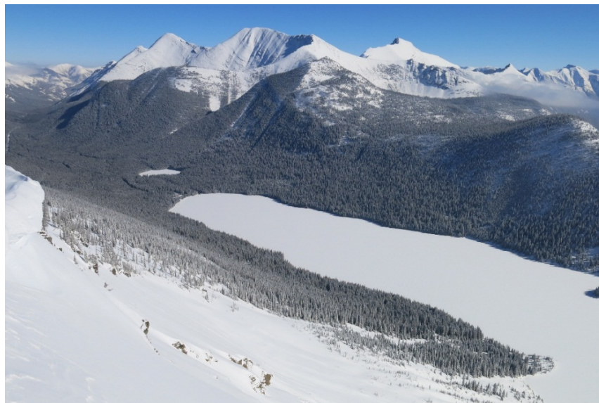
Cameron Lake from Forum Ridge February 2015

Brent: Yes we have seen that. We've seen places where the wind ...you would not expect to see surface hoar surviving due to winds and warm temperatures and yet it has been there and has caused avalanches and avalanche accidents ...in places which are lee slopes where the wind is not really curling in. Or even on steep slopes where the wind seems to split like Cameron Lake ...the north south (valley) ...along the Summit Lake side ...the wind seems to split and go over Grizzly Pass ...and then down the Cameron Valley. And it (the wind) seems to leave the center of that area kind of untouched and that's where one of the slide paths is still evident ...that's the one that almost got Keith McDougall. There is some quirkiness to any avalanche terrain in the winter.