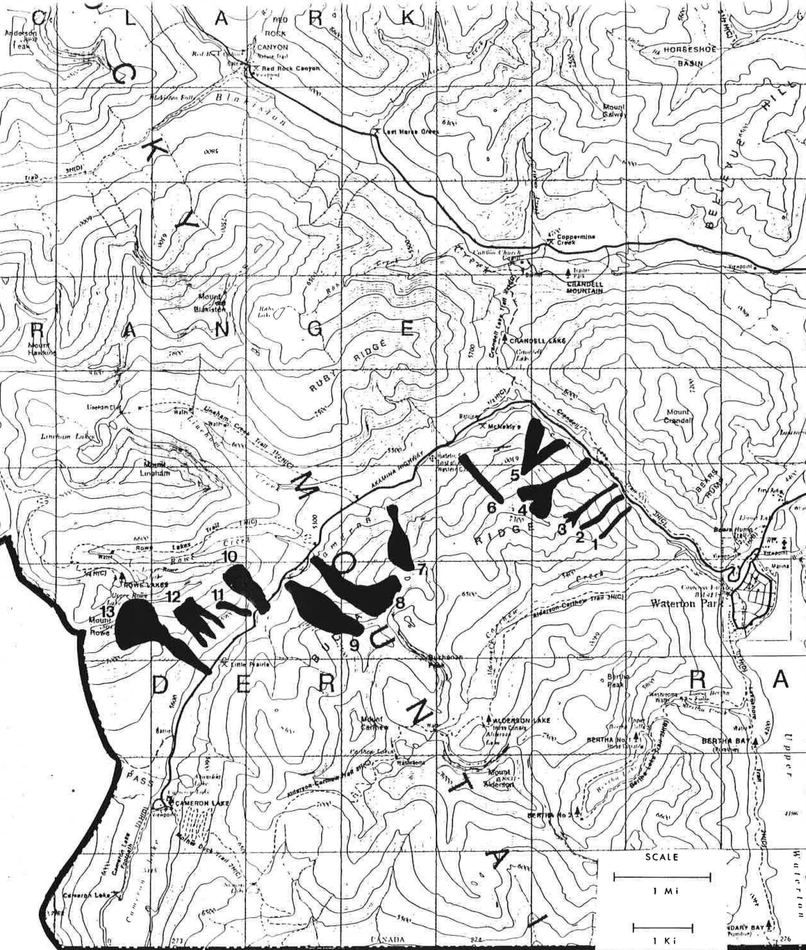
Figure 1. Existing avalanche slidepaths which may affect the Cameron road or ski trails. Cameron Valley, Waterton Lakes National Park,