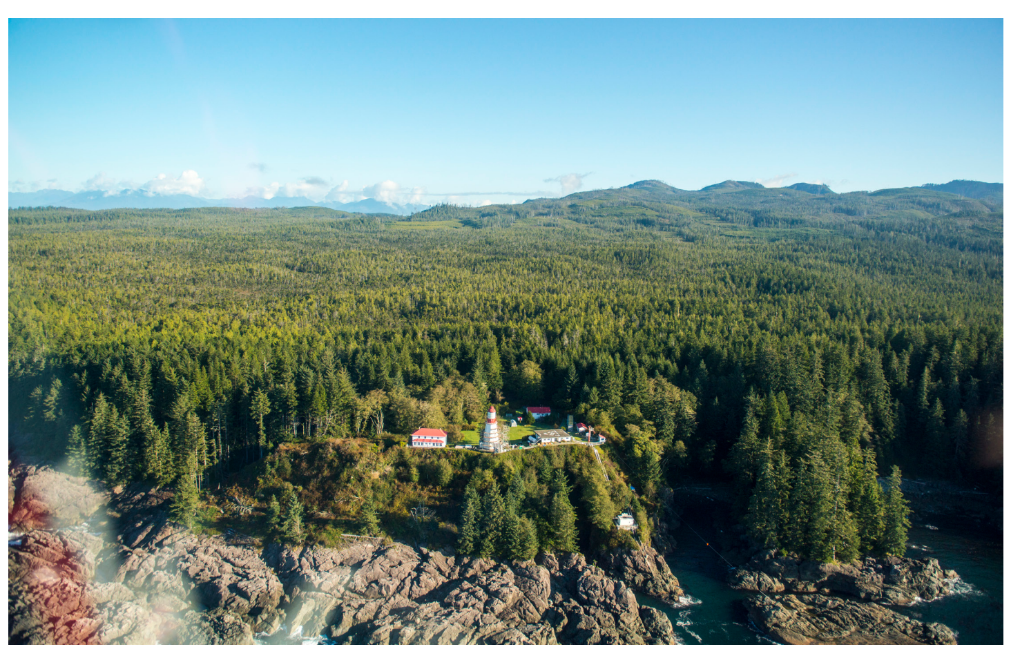
Pacific Rim National Park Reserve of Canada - West Coast Trail Preparation Guide 2021