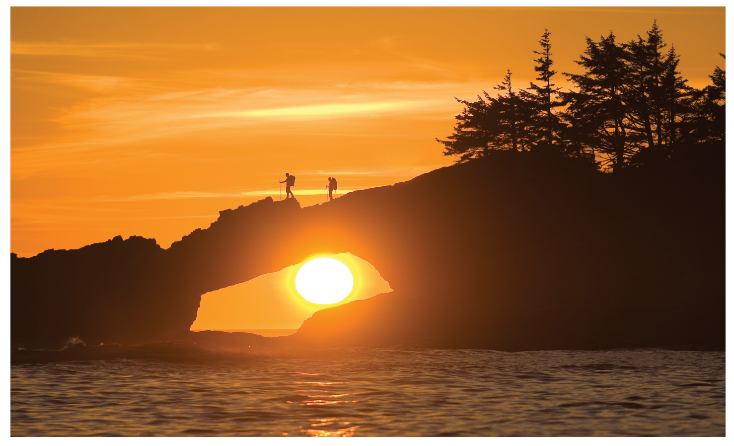
Pacific Rim National Park Reserve of Canada - West Coast Trail Preparation Guide 2021