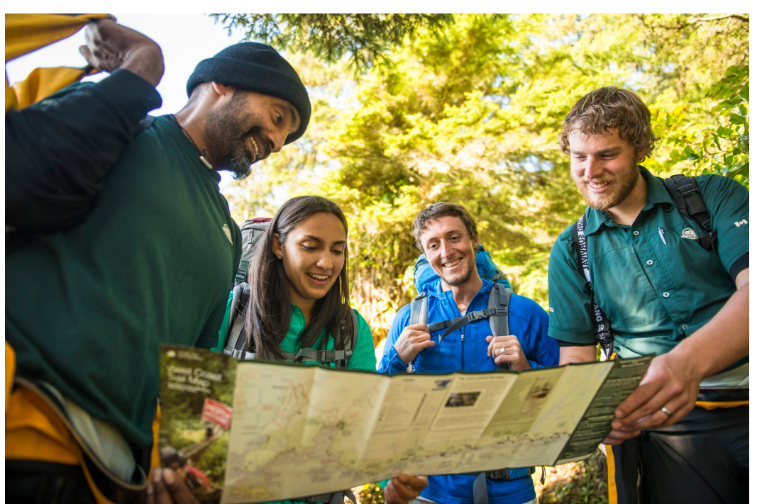
Pacific Rim National Park Reserve of Canada - West Coast Trail Preparation Guide 2021

During wet, rainy weather, occurrences of physical injury and hypothermia increase significantly. Hypothermia is the