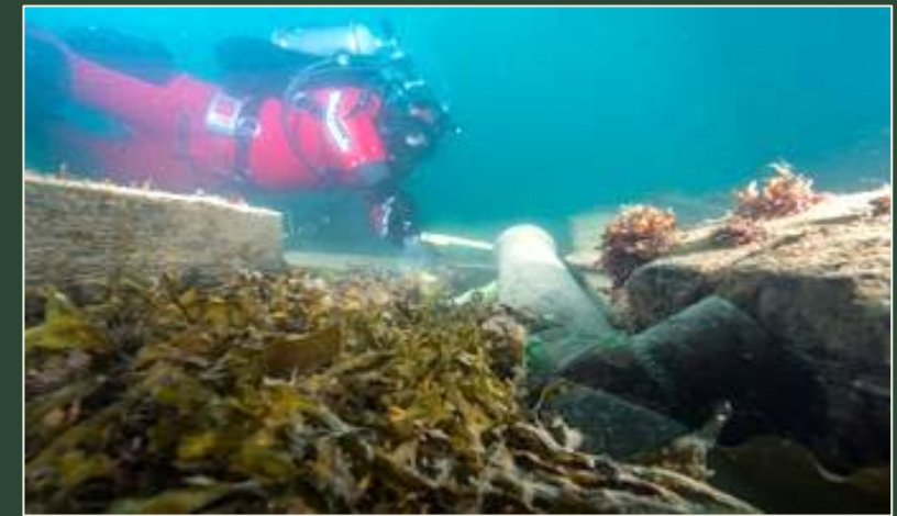
Wreck of HMS Erebus