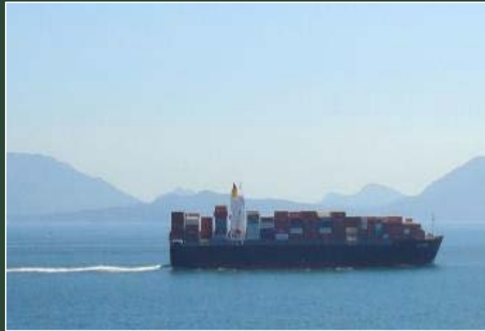
Shipping near Gulf Islands National Park Reserve