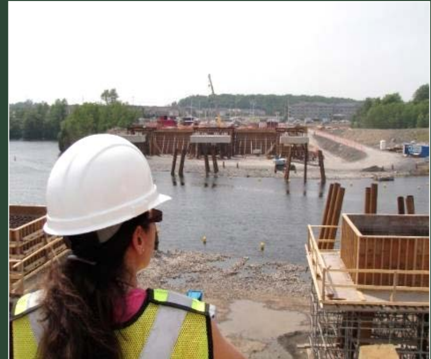
Vimy Bridge Construction, Rideau Canal NHS