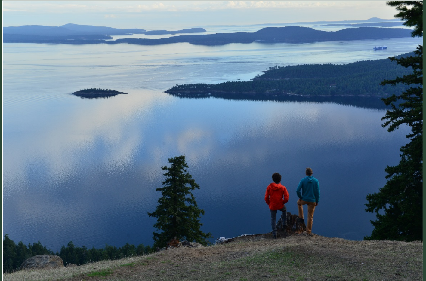
Gulf Islands National Park Reserve, British Columbia

“To protect and present nationally significant examples of natural and cultural heritage and foster public understanding, appreciation and enjoyment in ways that ensure ecological and commemorative integrity for present and future generations.”