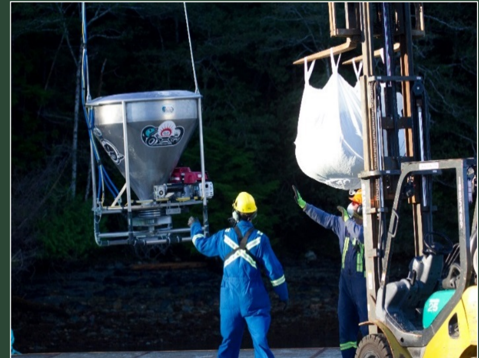
Night Birds Returning, Gwaii Haanas National Park