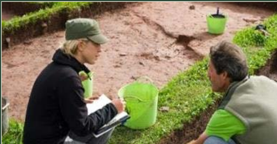
Archaeological Dig, Beaubassin National Historic Site, Nova Scotia