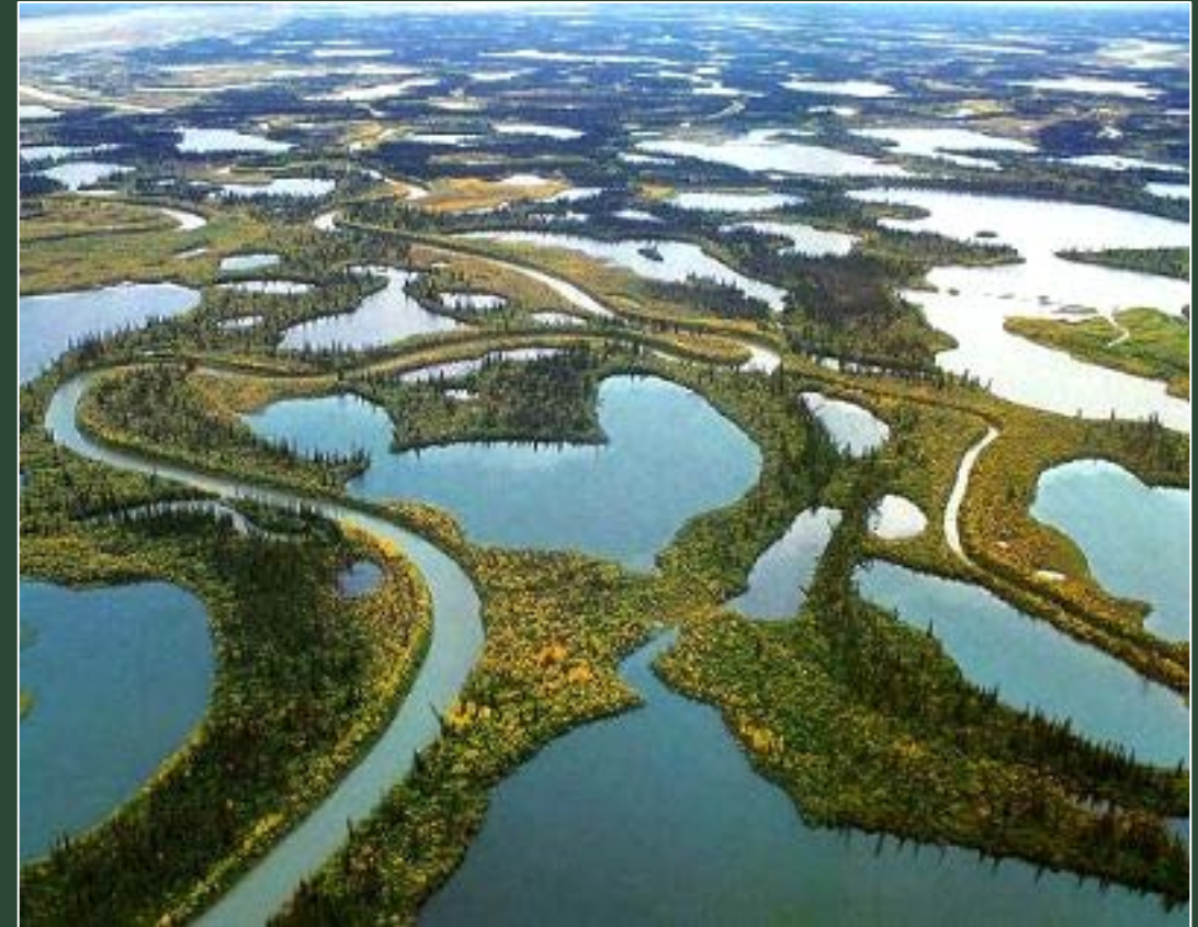
Peace Athabasca Delta, Wood Buffalo National Park