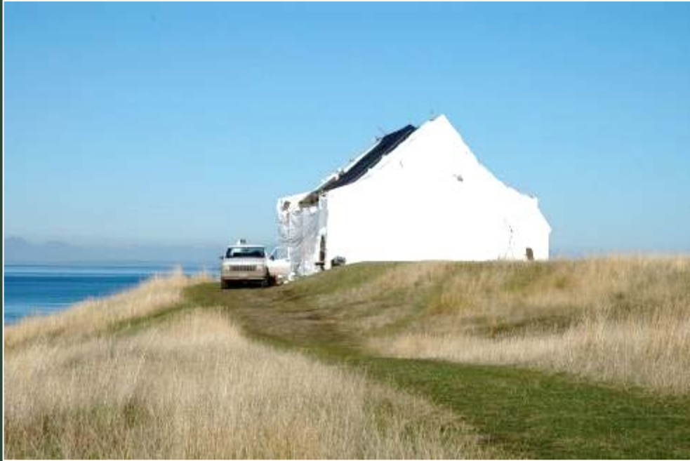
Building encapsulation during lead paint remediation, Saturna Island, Gulf Island National Park Reserve