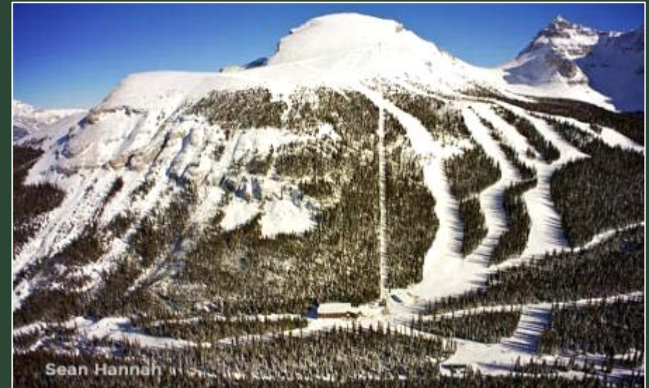
Sunshine Ski hill, Banff National Park