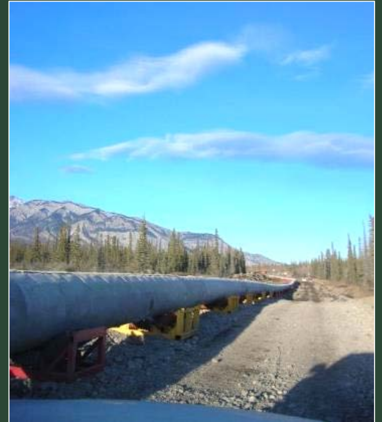
Jasper National Park, TMX Pipeline