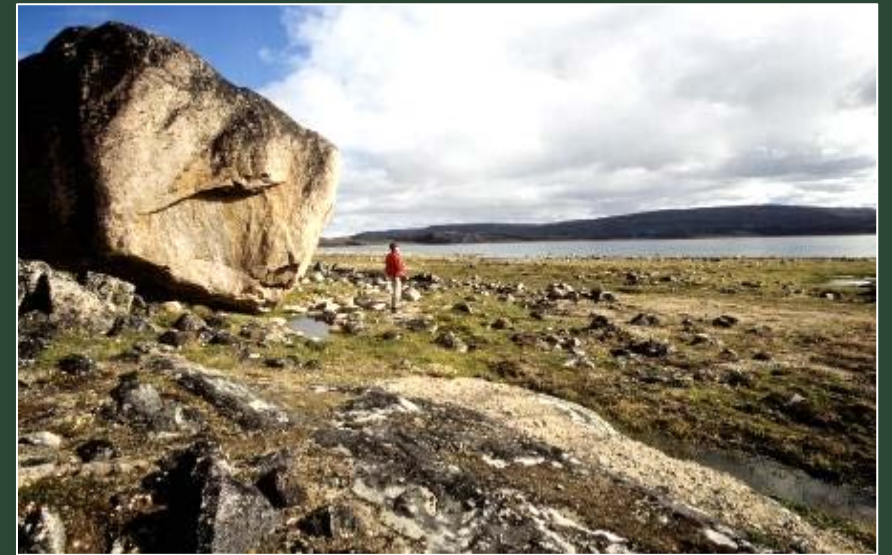
Ukkusiksalik National Park