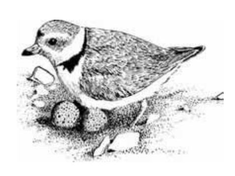
Male and female piping plovers take turns incubating eggs.

Piping plovers usually arrive in Atlantic Canada in April to establish nesting areas and form pairs. Their nest is a small depression in the sand, just above the high tide line, which may contain a few small shells and rocks for camouflage. They usually lay four eggs. Both adults help with incubation and after about 26 days, the young hatch. Within hours, they leave the nest and follow their parents in search of their first meal. A favourite food is beach hoppers or marine worms and insects, which they find in the sand. If all goes well, after about 20 to 25 days, the young are able to fly.