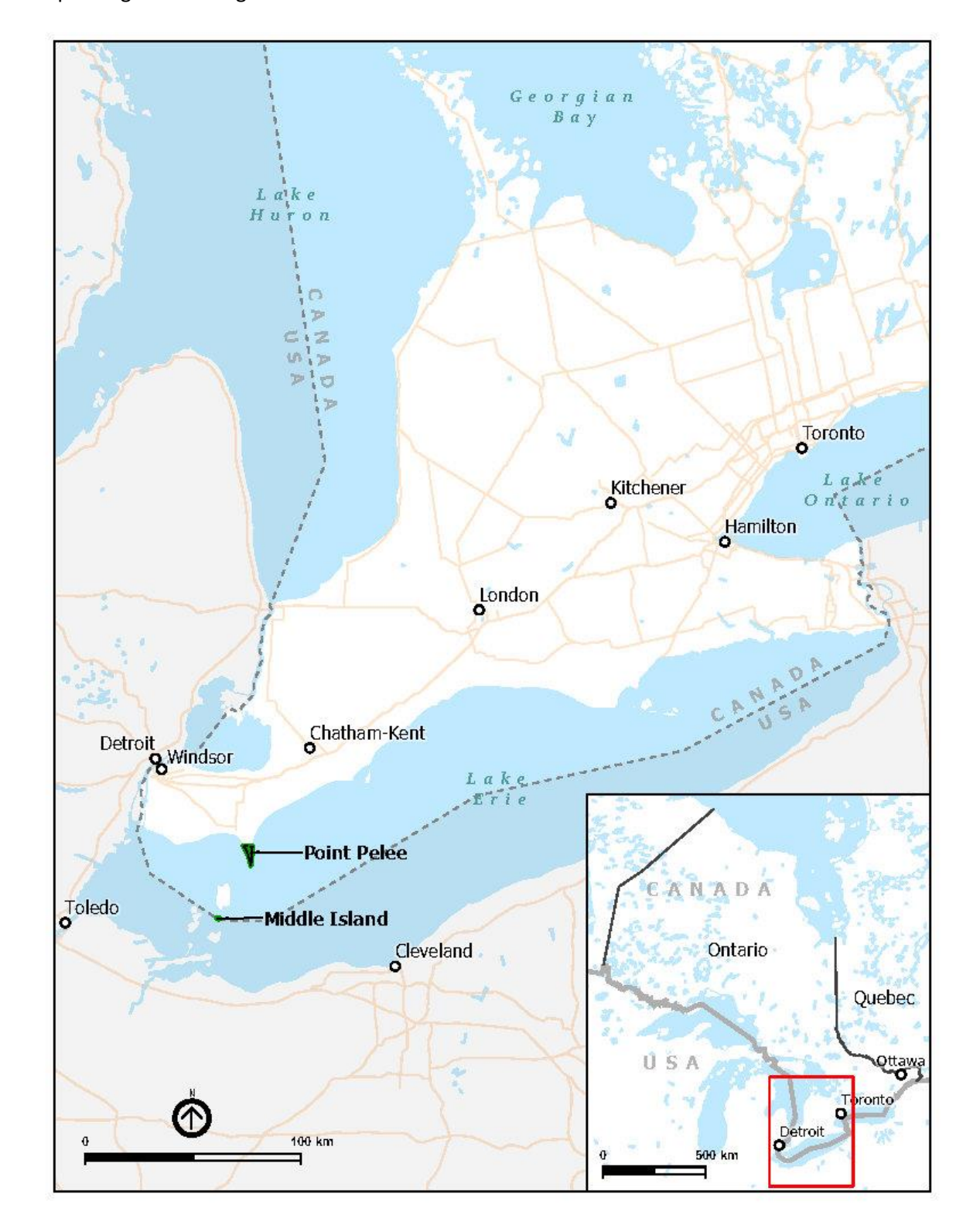
Map 1: Regional Setting