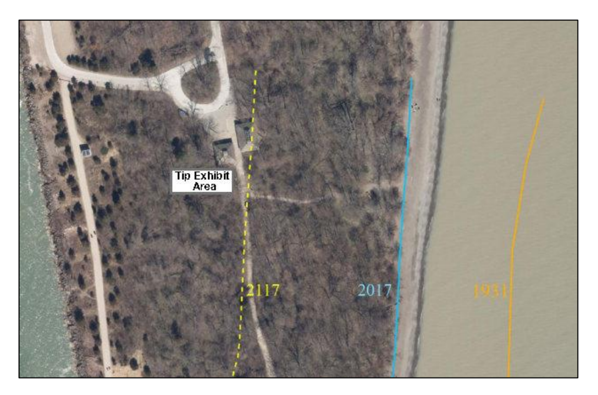
Figure 1 Past, present and estimated future location of the eastern shoreline adjacent to the Tip Exhibit Area (assumes continuous maintenance of west shore armour stone revetment)

Neighbouring municipalities, stakeholders and partners on the Lake Erie shoreline are also increasingly impacted by the effects of climate change, with more frequent, intense storms, and changing water levels causing significant damage to both land and infrastructure. The northeastern shoreline of the entire Point Pelee landform, including Point Pelee National Park and lands north, is a hotspot of erosion. Lands immediately to the north of the national park are below the elevation of Lake Erie and are protected from flooding by an aging dike system. The threat of a breach in these deteriorating dikes is increasing with higher lake levels, causing potential for serious economic, social and environmental consequences. It is clear that without concerted, collaborative efforts to develop and implement scale-appropriate mitigation and adaptation strategies, key coastal areas along Lake Erie – including Point Pelee National Park itself – will be at significant risk.