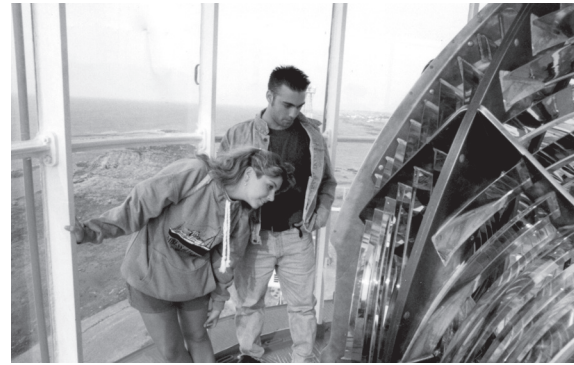
Visitors looking at the prism inside the lantern at the top of the 1909 lighthouse Musée de la mer

When exhibits were set up on the first and second floors of the lightkeeper's house, the windows were blocked to maximize exhibit space. These modifications darkened the rooms and cut visual contact with the outside of this historic site. On hot days, the heat and bad circulation may bother some visitors. As with the 1909 lighthouse, the second floor of the house is not handicapped accessible.