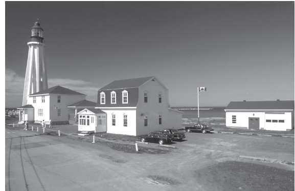
Assistant lightkeeper's house (centre) and lightkeeper's house (left)

The foghorn building is the oldest structure of its kind still intact. It was built in 1903 to house the station's audible navigation signal. This building was restored in 1994. The foghorn building was designated a recognized building by the Federal Heritage Buildings Review Office due to its historic significance, its architectural interest, and its exceptional value in relationship to the elements surrounding it. Today, the building houses an exhibit on audible navigation signals.