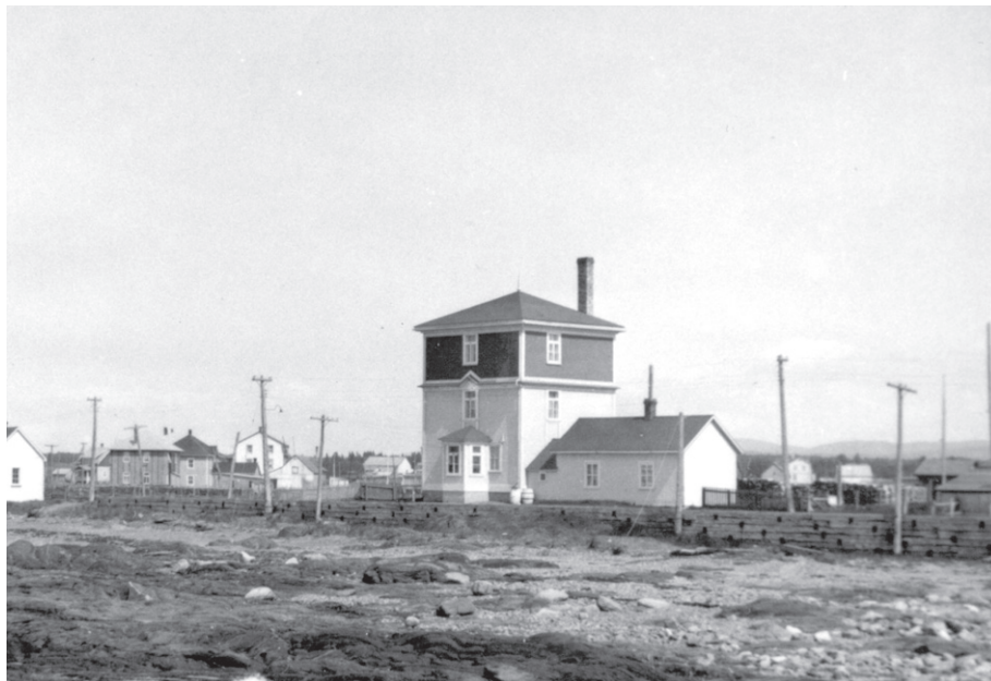
Second lighthouse, converted into pilots' residence, and the wharf along Rue du Phare (between 1924 and 1956)

Over the years, the Pointe-au-Père site expanded and navigational aid facilities multiplied. Following repeated requests from ship owners and shipping company owners, the Canadian government moved the Bic pilot station to Pointe-au-Père in 1905. The wharf, added between 1902 and 1905, was a prerequisite for this transfer. From 1923 to 1937, the pilot station handled some of the Grosse-Île Quarantine Station's activities, including medical inspections of passengers on ships travelling upriver.