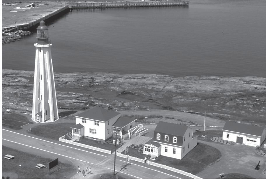
Aerial view of part of the Pointe-au-Père Lighthouse Station

Parks Canada must protect and develop representative examples of Canada's natural and cultural heritage and promote public knowledge, appreciation, and enjoyment in a way that keeps these examples intact for generations to come. To do so, Parks Canada has adopted the following strategic objectives to guide its activities over the next five years: