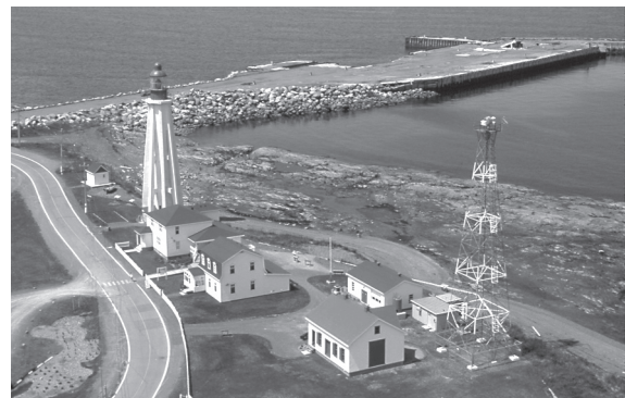
Aerial view of the Pointe-au-Père Lighthouse Station and old pilot boat wharf

the lighthouse. In 1981, Transport Canada transferred the assistant lightkeeper's house to Parks Canada. In 1982, Parks Canada signed a cooperative agreement with the Musée de la mer corporation to run the site. Under this agreement, Musée de la mer agreed to open the site to the public, present interpretation activities related to the themes and objectives of the National Historic Site and Musée de la mer, 2 and provide a variety of visitor services. In 1987, the lightkeeper's house was transferred to Parks Canada. Over time, other buildings tied to lighthouse operations were gradually transferred to Parks Canada. In 2005, Fisheries and Oceans Canada transferred to Parks Canada a 1009.8 m 2 lot containing the fourth lighthouse and a shed.