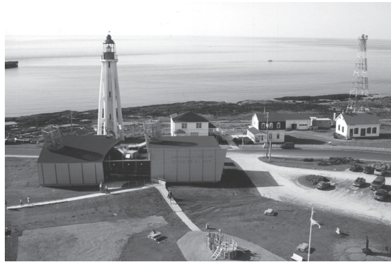
Aerial view of the Empress of Ireland Pavilion (front) and the lighthouse station (background) Musée de la mer

and offers reception services (including those for the National Historic Site), washrooms, an exhibit room, and a multimedia show. Its focus is the Empress of Ireland passenger ship that sank off Sainte-Luce in 1914. 5 The pavilion is located outside Parks Canada property. The themes presented by Musée de la mer are not related to the reasons the site was designated an National Historic Site. Two large parking lots belonging to Musée de la mer give visitors a place to park their vehicles near the site (Map 2, p. 29). Near the lighthouse, a pilots' shelter replica built by Parks Canada is used for interpretation purposes.