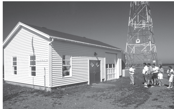
Garage Parks Canada / J. Audet

The skeleton tower is the fourth lighthouse built at the site. It was installed as part of the lighthouse station automation phase (or second modernization phase) in the 1970s.