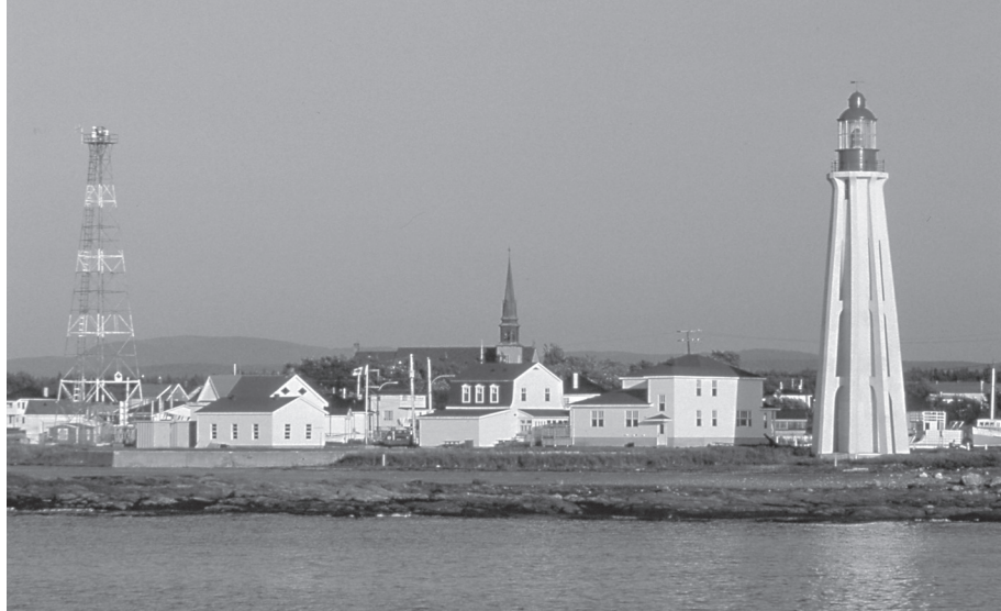
View of the Pointe-au-Père lighthouse station from the St. Lawrence River