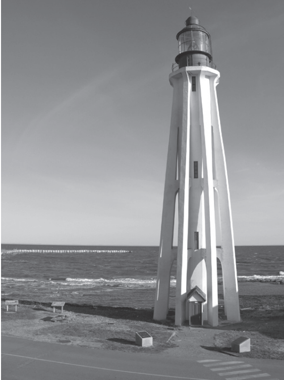
The third lighthouse, built in 1909

A house was built in 1909 for the fog signal engineer. It later became home to the lightkeeper, and then the assistant lightkeeper. Today, the building houses a snack counter, washrooms, and Musée de la mer administrative offices. It is currently known as the Assistant Lightkeeper's House .