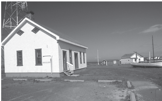
Foghorn building

Built in 1956, the Lightkeeper's House was home to the lightkeeper and his family until 1988. It evokes the lighthouse station's more recent past. It underwent a number of transformations as the site was developed. When the exhibits were set up in the early 1990s, the rooms were rearranged and the building's footprint was increased with the addition of an annex. Today, the lightkeeper's house contains the souvenir shop and exhibits.