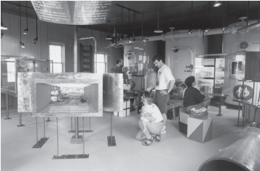
Exhibit inside the foghorn building Musée de la mer

The current exhibits at the administered site do not convey all aspects of the commemoration messages that must be presented at the national historic site. Particular