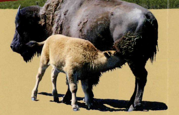
Protective moms will defend their calves