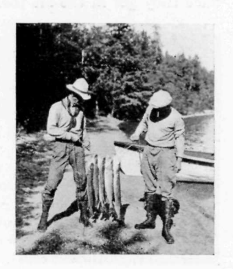
A good catch from Crean Lake

From Sanctuary Lake there is a portage of about 300 yards to