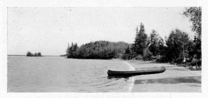
Sandy Beach on Crean Lake

The beauty of these northern lakes and rivers, the primeval freshness of the entire region, must make this new reserve a much sought playground. To paddle for days by these uninhabited shores, far beyond the sound of motor car or railway, to travel through woods so solitary that even the breaking of a twig becomes exciting because it may mean the passing of an unseen wild animal, to make camp beside some clear flowing