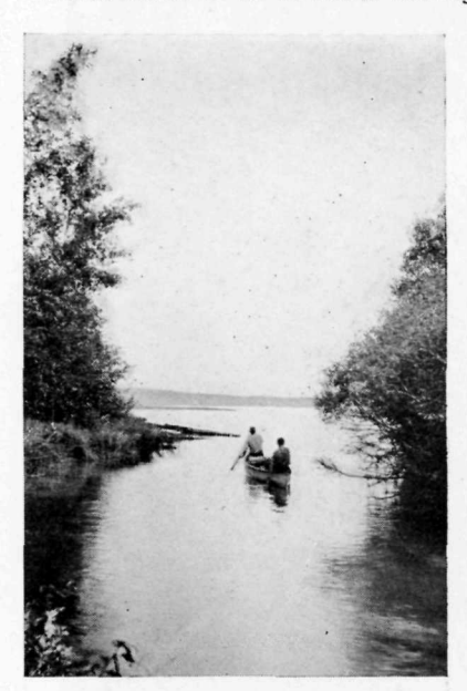
Entrance to Kingsmere Lake from Kingsmere River

Leaving the town the road passes through the splendid pines of the Nisbet Forest Reserve, which contains some of the finest stands of jack pine in the country. Emerging, for the next fifteen miles or so it leads through a fine farming district, with