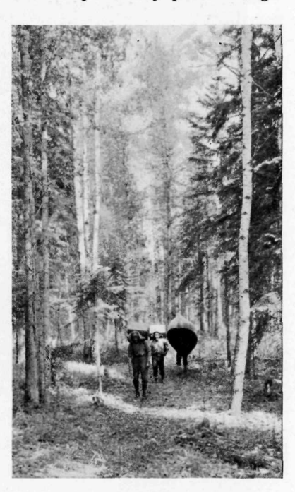
Smith's Portage, between Kingsmere Lake and Clare Lake

The approach to the park lies by way of the thriving city of Prince Albert, the most northerly city of the province. In the old fur trading days Prince Albert was one of the most important centres of traffic. Here the dog trains outfitted in winter for the Far North and here in summer arrived the rich loads of fur brought down by canoe from Isle la Crosse. By its doors flows the North Saskatchewan, born amid the glaciers of the Rockies and carrying the tributes of hundreds of miles of