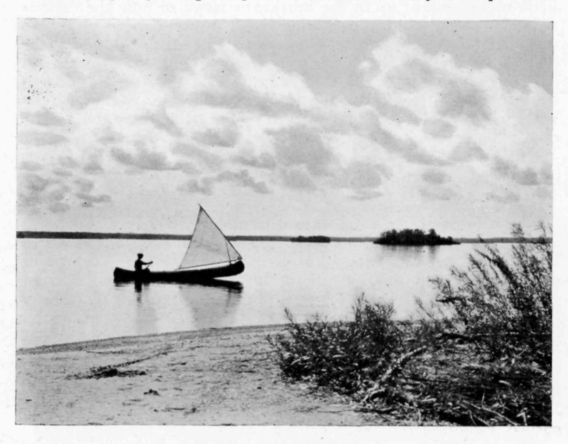
Evening on Cream Lake

The region now within the park was once the hunting ground of the Cree Indians, a tribe of whom now live on a reserve immediately adjoining the park to the east. They are a peaceful