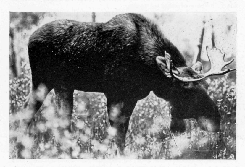
Young Bull Moose

Turning to the right the road curves about "Prospect Point," a high bluff heavily wooded with pines, spruce and poplar, at an elevation of about one hundred feet above the water, then drops