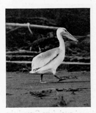
American White Pelican

To the Indian the pelican has always borne a sort of half-human personality. It appears often in their stories as one of the wisest of birds. Was it not the pelican, indeed, who saved the life of Wee-sa-ka-chack and his brother, Little Wolf, when they were pursued by the terrible Rolling Head, so that to this day the pelican is under the special favour of Old Man himself and must not be shot wantonly without incurring his displeasure!