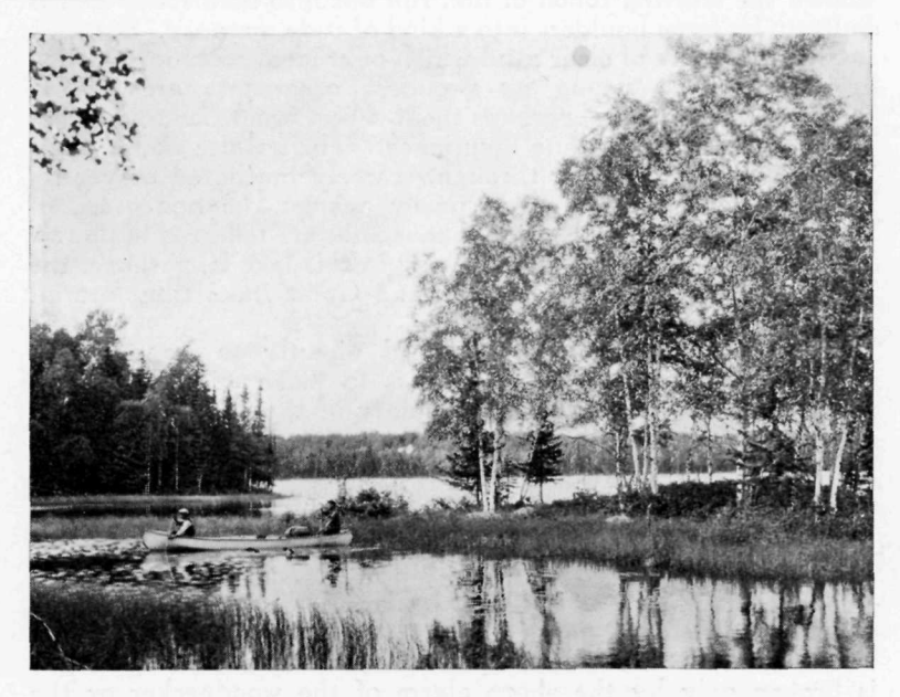
"In the heart of the listening solitudes"

forms a pleasant waterway from one to the other. Leaving Waskesiu Lake, for the first two miles the paddling is easy. The waters flow down without a murmur, slipping silently as an Indian, through a thick forest of willow, white birch, poplar and spruce. Here and there, in the low places along the shores, families of wild ducks make their home and at the sound of the