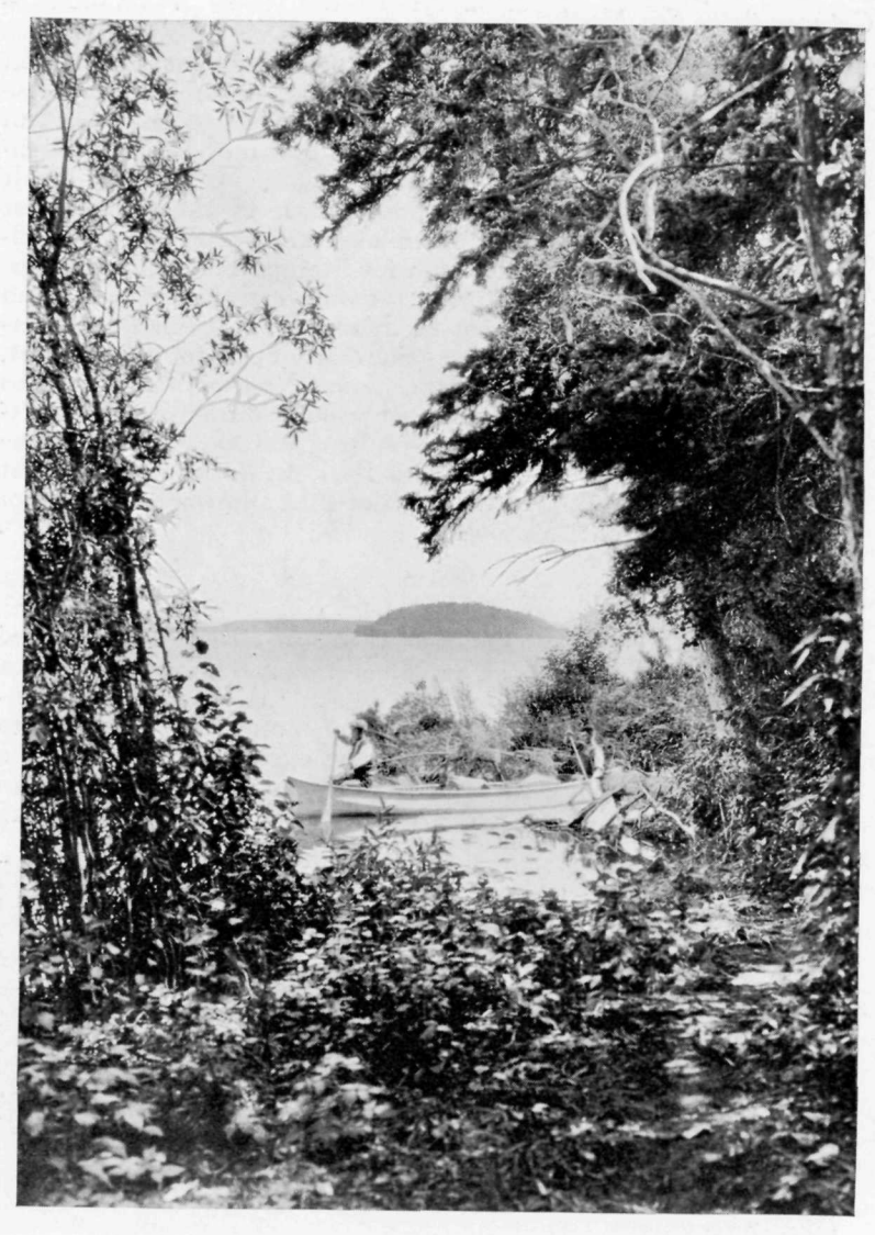
Looking back from Clare Point to Island, Waskesiu Lake