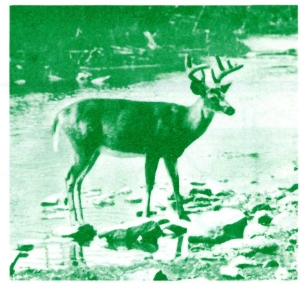
Whitetailed deer at its watering place.

Bedrocks are exposed in only a few places within the Park, being mainly covered by thick deposits of glacial till, left by the glaciers when they receded from the area for the last time about 10,000 years ago. The beautiful topography of the Park