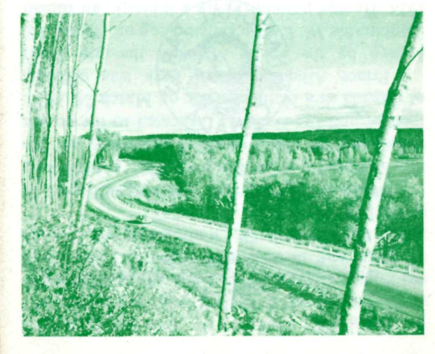
Ancient glaciers carved these rolling hills and lake beds.

The first person to suggest that this area be preserved as a National Park was E. R. Trippe, a frequent hunter who had built a hunting lodge on the south shore of what is now Lake Waskesiu.