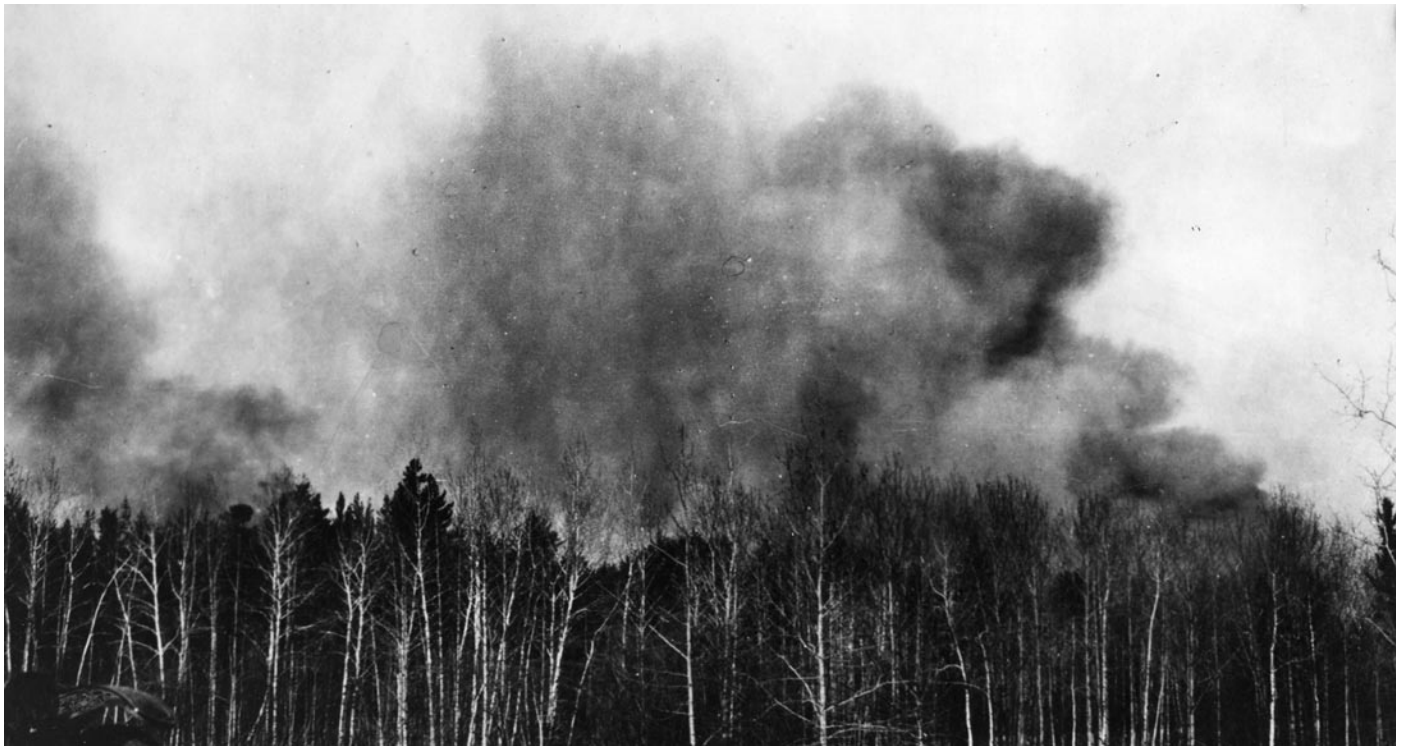
The fires of 1919 were typically characterized by dense clouds of smoke frequently described by observers as turning day into night.

the ground was drier and the rivers and lakes lower than they have been for many years in the memory of the older settlers. Very little rain fell in northern Saskatchewan until the first week in June. The month of May was a month of extreme heat and high changeable wind, the temperature for days at a time ranged between 70° and 90°, and the winds, first in one direction and then in another, blew almost [like] a hurricane.” 22