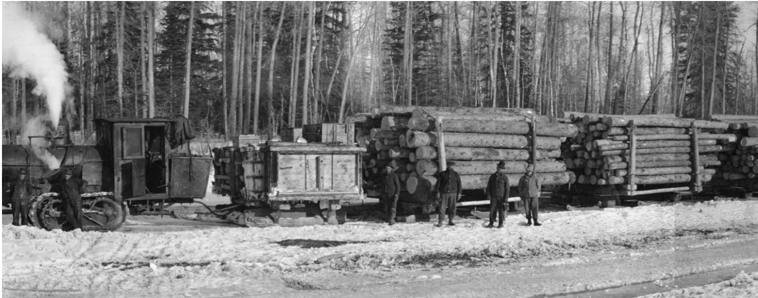
A steam tractor hauls logs from the Sturgeon River Forest Reserve in Saskatchewan. Large-scale logging on the forest reserve ended after the fire of 1919.