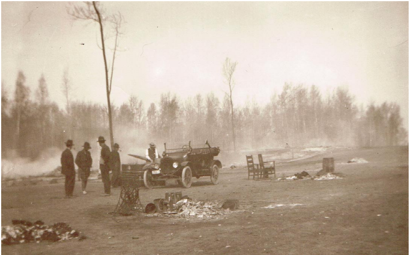
The meager remains from burned homes in Lac La Biche after the fire of 1919.