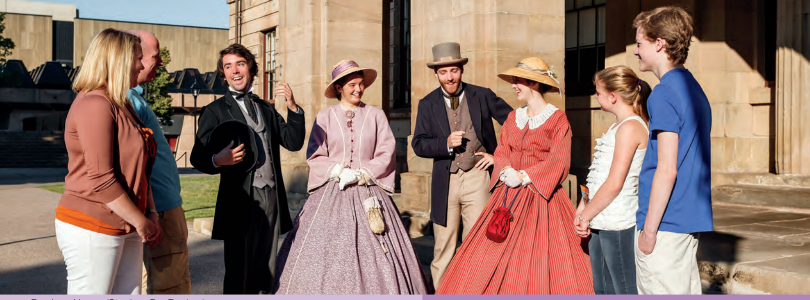
Province House