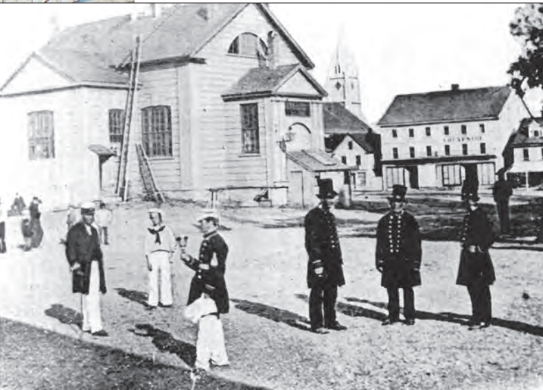
The John Plaw Court House, home of the Prince Edward Island Legislature from 1812 to 1847 (Cullen 1977, 237).

Before the Colonial Building was built, the Prince Edward Island Legislature first met in private homes and taverns and eventually, in the John Plaw Court House. By 1837, then Lieutenant Governor Sir John Harvey, made it plain to the legislature that the colony should have a new building for the safe custody of its public records. No one could disagree, and £5,000 was set aside to provide for a legislative building to house the two branches of the legislature, as well as colonial offices. They would need at least another £5,000 to include the Supreme Court before the building was completed.