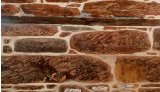
Completed in situ repair test.