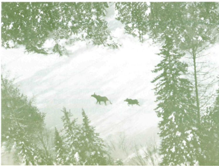
Moose on the Pukaskwa River.