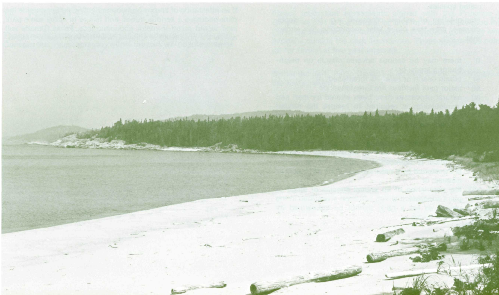
Sand beach near White Gravel River