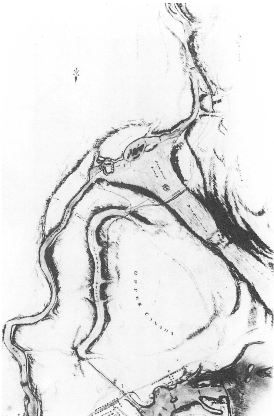
Proposed Layout, Entrance Valley to the Hog's Back, 1828 (Parks Canada, based on T. Burrowes' map)