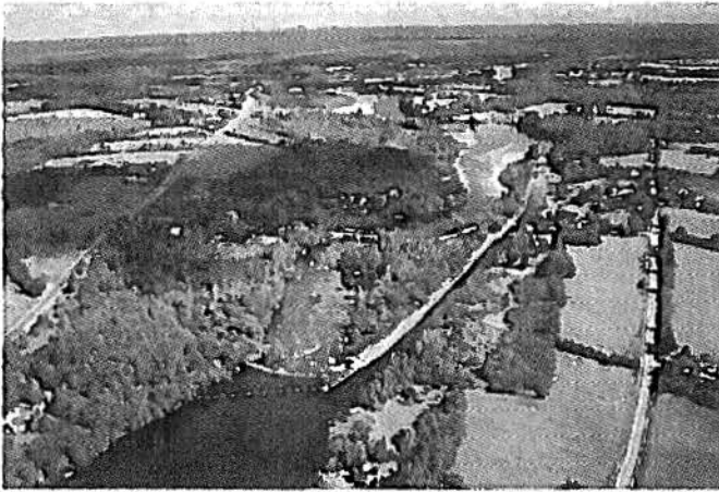
Aerial photo. Date unknown.