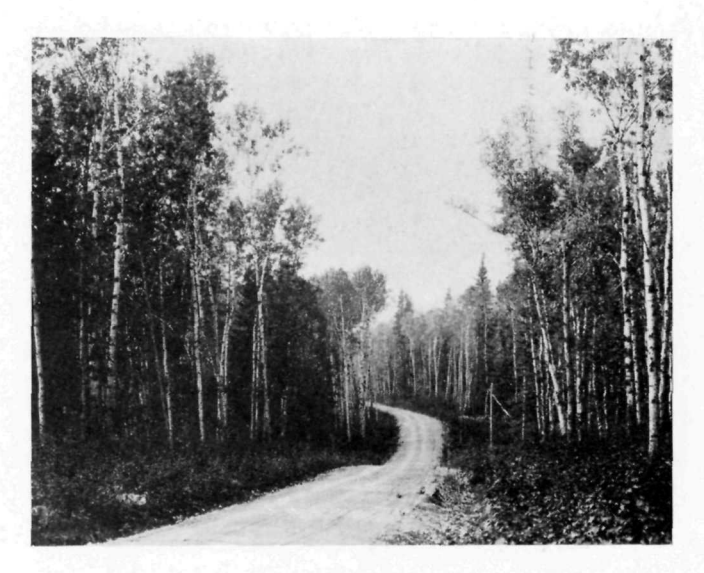
Audy Lake Road

An alternative route may be chosen by following No. 4 highway from Neepawa through Minnedosa to a point about six miles beyond Minnedosa over No. 4 highway, thence north over a picturesque winding road recently constructed to the southern gateway of the park, which is less than a mile from the townsite at Wasagaming. The distance from Winnipeg over this route is 172 miles.