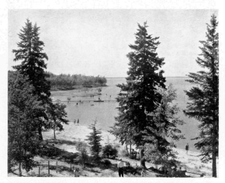
Looking towards Treasure Island and Motor Campground

A full line of camping supplies is carried by a number of stores which operate within the townsite, while photographic material and souvenirs are also available.