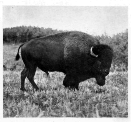
Young Buffalo Bull

Included with the buffalo are a number of native elk, moose and deer. Most of these animals are now