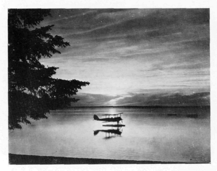
The Sunsets in Riding Mountain National Park are Noted for Their Remarkable Beauty of Colouring

The largest and finest of these is Clear lake situated near the southern boundary of the park. lovely sheet of water, nine miles long and varying in width from one mile to two miles and a half, reflects in its limpid waters the hues both of earth and sky. Seen from a little distance it appears blue as the eve of a child, but at close hand it sparkles with the deep hues of an emerald. In places sandy beaches send their amber reflections through the clear green turning it to olive, in others overhanging spruce and birches convert it to jade and onyx. But never do the waters lose their crystal limpidity, and when the wind is still, you may see a fish lying on the bottom thirty feet below, or detect bubbling up through the gravel, some of the springs which help to feed the lake. The greatest depth of the lake is about 150 feet. Graceful headlands and curving bays, fringed with spruce and balsam fir, break the shore line and invite canoeists to linger and