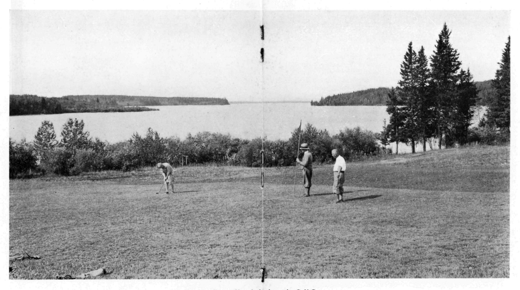
Looking Down Clear Lake from the Golf Course.