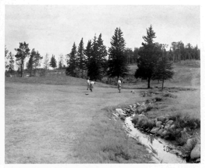
Holing Out near Bogey Creek

There are several beaches on Clear lake suitable for bathing but the main beach on the south side of Clear lake, near the centre of the townsite of Wasagaming, is the most popular. Clean sand, shelving gradually out, provides delightful opportunities for the experienced swimmer and diver as well as safety for children. A bathhouse has been provided for the use of bathers. Towels and bathing suits must be personally provided or can be secured from a private enterprise.