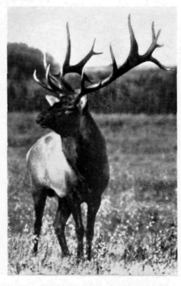
The Wapiti, or Canadian Elk

its plains and woodlands. These beautiful creatures form one of the greatest attractions to visitors. Often, in early morning on the meadows near lake Audy, or along some outlying trail one may come upon a herd of 50 or 100 of these graceful animals walking with dainty feet that scarcely touch the earth, and necks proudly thrown back to balance their magnificent antlers. Moose and deer are frequently seen in the thickets or at the edge of one of the crystal lakes, where they come to drink, while marks of those busy woodsmen, the beaver, may be found along many a Page Ten