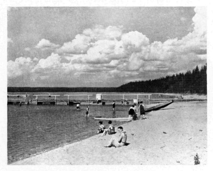
The Broad Sandy Beach forms an Ideal Playground

the joint direction of the Governments of Canada and the United States, traced its successive beach lines and named it lake Agassiz, in honour of the distinguished scientist, Prof. Louis Agassiz, the first prominent advocate of the theory that the glacial drift was caused by land ice. South of Riding mountain another lake, then occupying the valley of the Assiniboine, probably