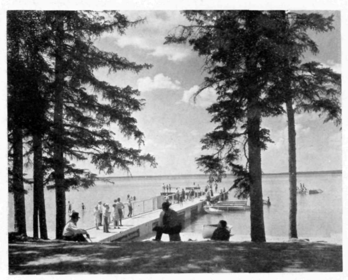
The Dock at Wasagaming is a Popular Centre for Aquatic Sports Page Eight

The view from the summit," writes Hind in his book, Red River and Saskatchewan Expeditions, "was superb, enabling the eye to take in the whole of Dauphin lake and the intervening country, together with part of Winnipegosis lake. The outline of the Duck mountain rose clear and blue in the northwest, and from our point of view the Riding and Duck mountains appeared continuous, and preserved a uniform, bold, precipitous outline, rising abruptly from a level country lying from 800 to 1,000 feet below them. The swamps through which we had passed, were mapped in narrow strips far below; they showed by their connection with the ridges, and their parallelism to Dauphin lake, that they had been formed by its retreating waters. The ancient beach before mentioned as extending far to