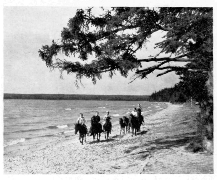
Pony Riding is Quite Popular

The park offers many fine opportunities for walking and riding. Forest trails lead to many parts of the park and for the lover of nature there is no more delightful way of studying the wild life and enjoying the peace and solitude of wild places. Eventually circular routes touching several of the other lakes in the park and giving access to the rough mountainous