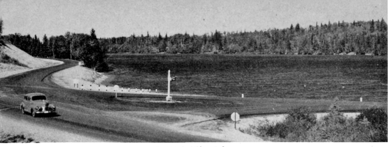
East End of Clear Lake