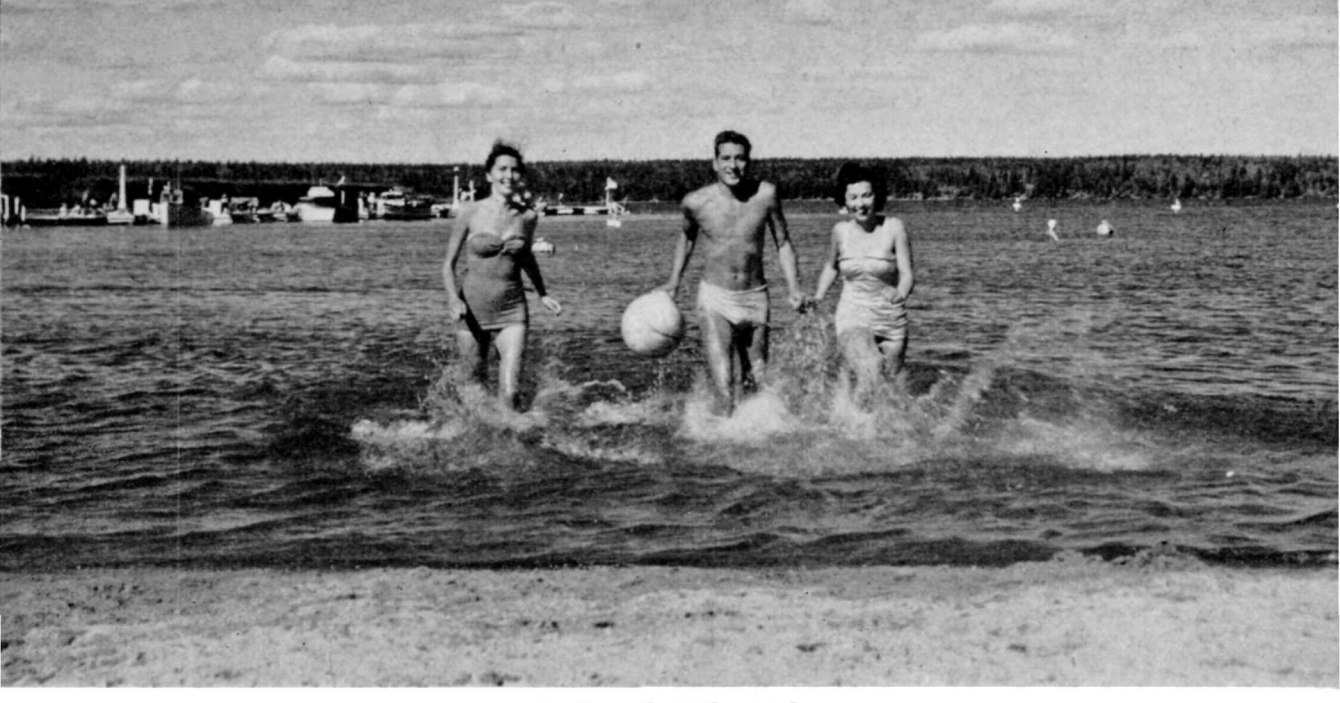
Cooling off at Clear Lake

sports and hunting eventually gave way to savage hostilities, and raids into rival territories ensued. As the buffalo, staple source of supply for the western tribes, began to disappear, the Assiniboines moved westward, and left the Crees in possession of the region. The ridges are believed to have been Indian highways for years, and one of the early explorers records that shale outcroppings near the summit of Riding Mountain were used by the Indians for making clay pipes.