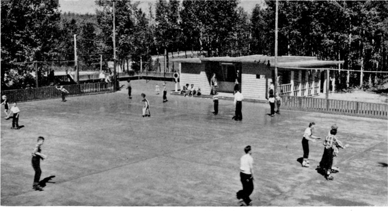
At the Outdoor Roller Rink

character of the park, as the road ascends the steep escarpment of Riding Mountain by long, easy grades. Within a travelled distance of about 3 miles an elevation of more than 1,000 feet is gained, and at various points are excellent views of the plains below that stretch away into the distance.