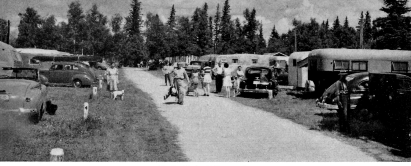
Trailer Park at Wasagaming

from Wasagaming. A bridle path follows the north shore of Clear Lake for about 5 miles and offers a fine ride or hike within sight of the water's edge.