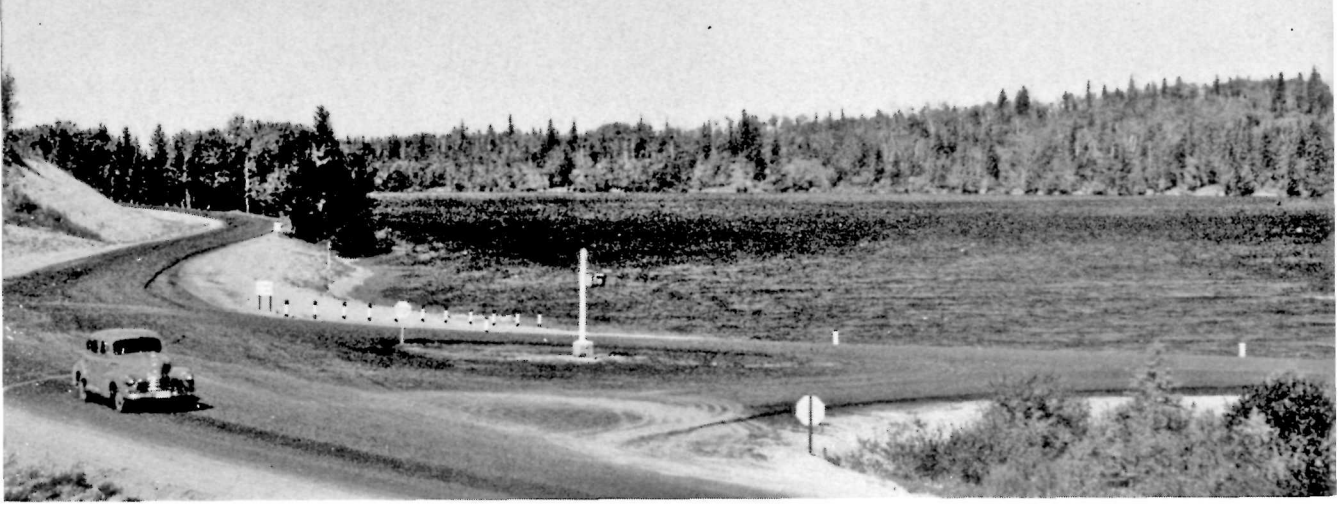
East End of Clear Lake