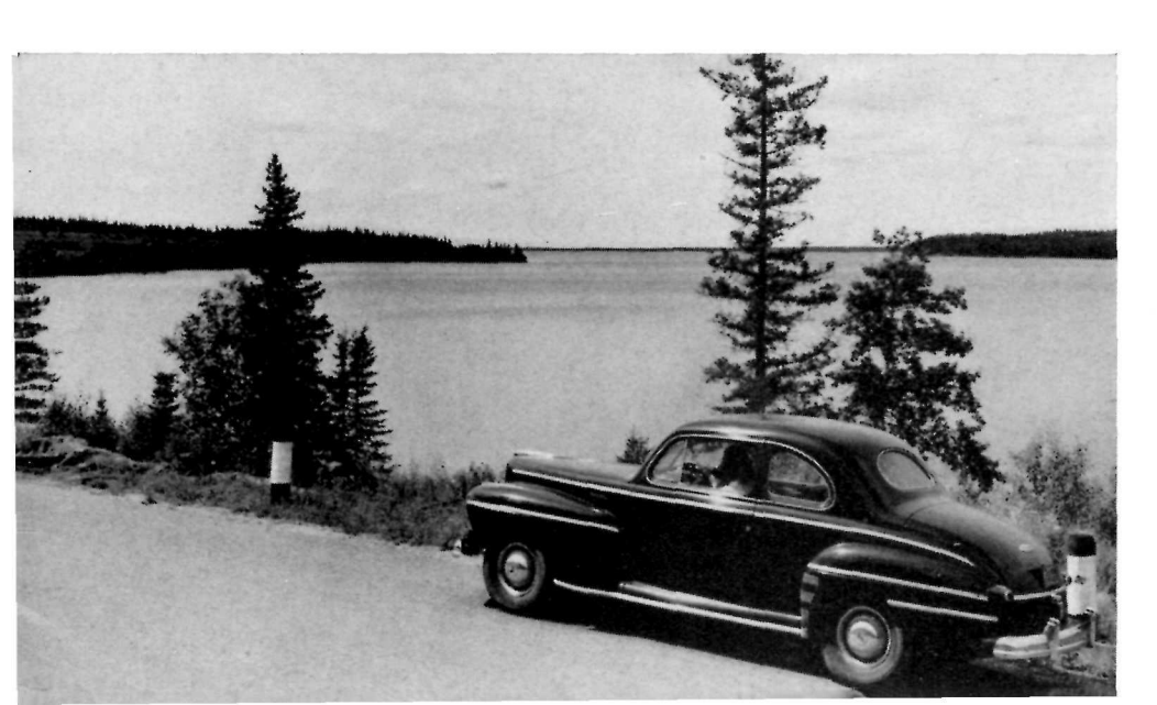
A Popular Viewpoint along Clear Lake

Riding enthusiasts have a choice of several fine trails over which to explore the region. Popular rides include those to Lake Katherine, 6 miles; Ministik Lake, 5 miles; and the Bubbling Spring near the golf course, 3 miles