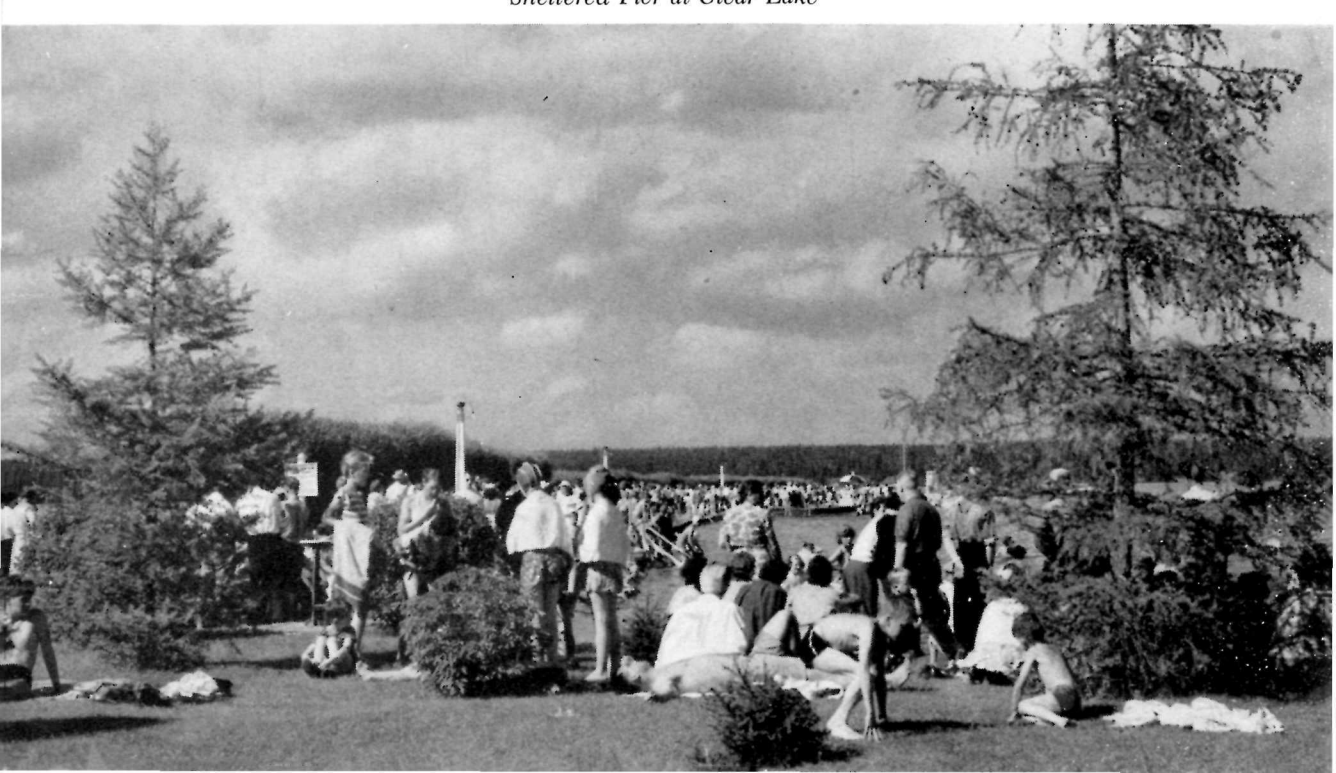
Sheltered Pier at Clear Lake