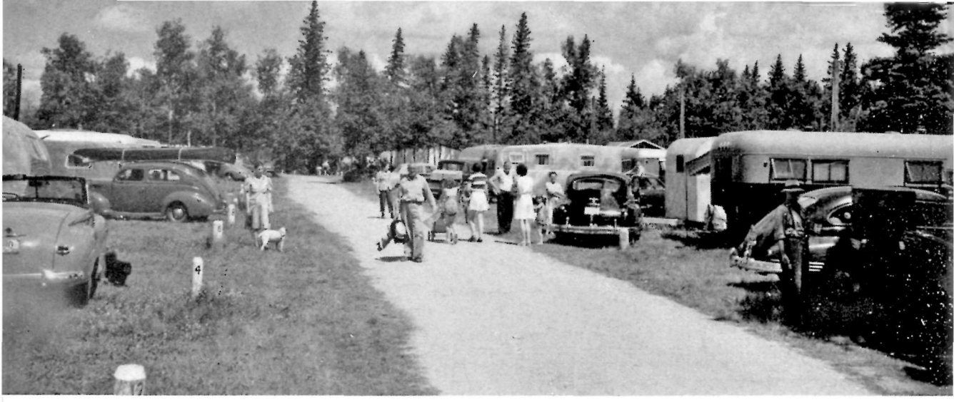
Trailer Park at Wasagaming

from Wasagaming. A bridle path follows the north shore of Clear Lake for about 5 miles and offers a fine ride or hike within sight of the water's edge.