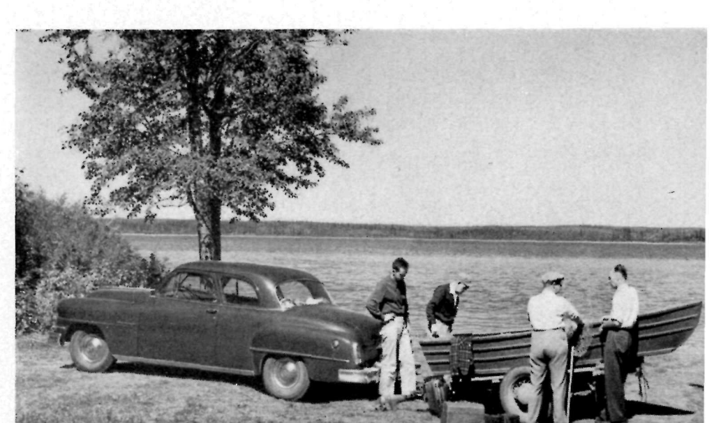
Fishing Party at Lake Audy

Riding Mountain National Park is admirably suited for the enjoyment of outdoor recreation. Sports open to visitors include swimming, boating, riding, hiking, tennis, golf, and lawn bowling—in addition to motoring along the scenic roads. A special area for baseball, softball, and field sports, as well as horseshoe pitch and children's playground, will be