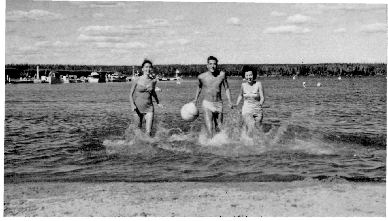
Cooling off at Clear Lake

sports and hunting eventually gave way to savage hostilities, and raids into rival territories ensued. As the buffalo, staple source of supply for the western tribes, began to disappear, the Assiniboines moved westward, and left the Crees in possession of the region. The ridges are believed to have been Indian highways for years, and one of the early explorers records that shale outcroppings near the summit of Riding Mountain were used by the Indians for making clay pipes.