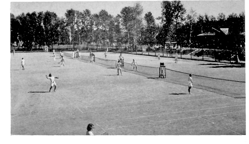
Practising for the Tournament

found near the public camp-ground at Wasa-gaming. A picnic ground, equipped with tables, benches, and stoves is also available. A motion picture theatre, an outdoor roller skating rink, bowling alleys, and a fine dance pavilion operated by private enterprise in Wasagaming extend the day's enjoyment.