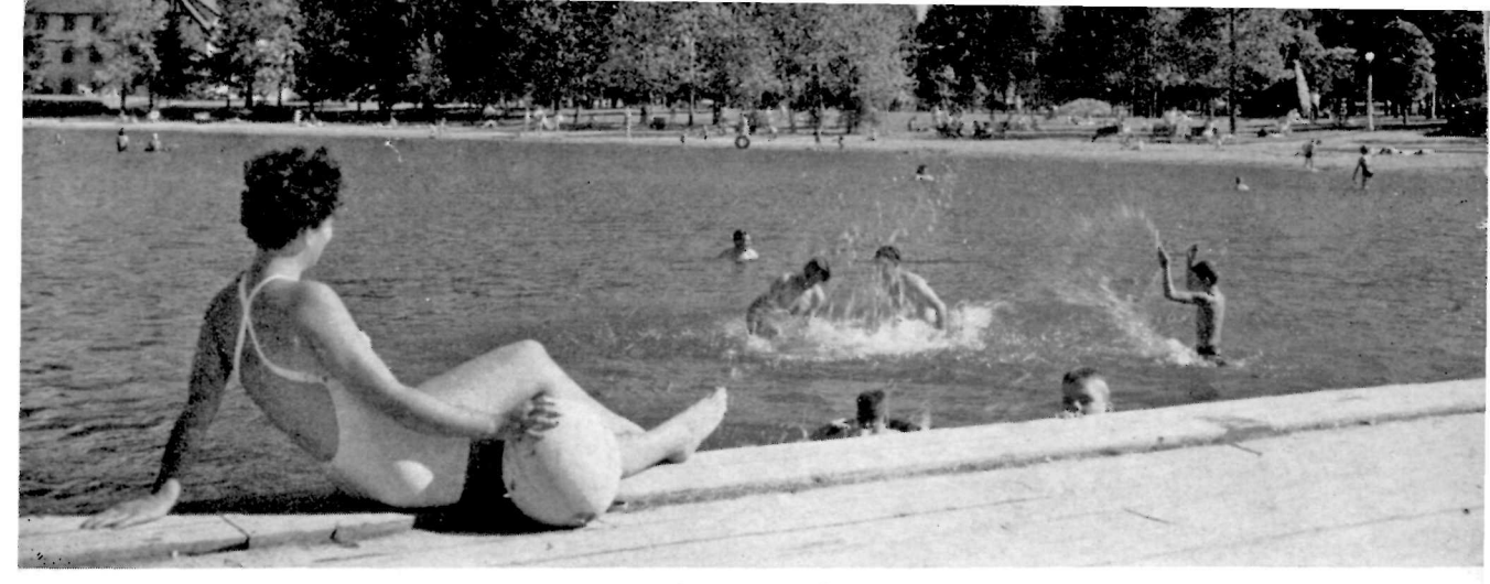
An Ideal Summer Playground