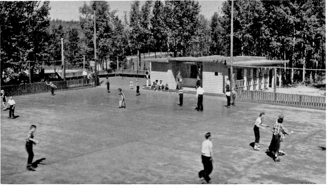
At the Outdoor Roller Rink

character of the park, as the road ascends the steep escarpment of Riding Mountain by long, easy grades. Within a travelled distance of about 3 miles an elevation of more than 1,000 feet is gained, and at various points are excellent views of the plains below that stretch away into the distance.