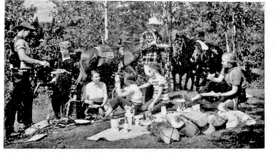
Picnicking on the Trail

of the building is a small garden, landscaped in English style with a small rustic summerhouse, fountain, and flagstone walks, making a delightful resting spot.