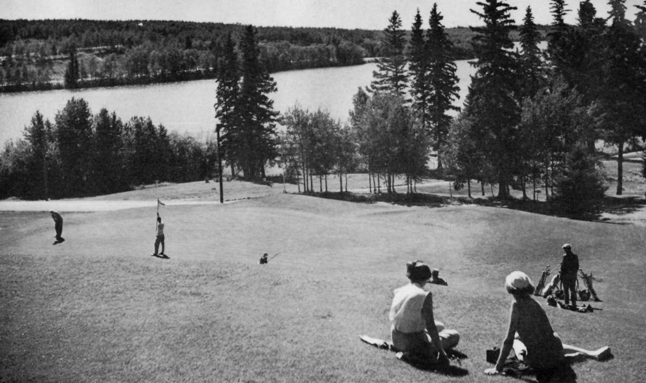
Spectators watch a golfer putt on the 9th green of the Golf Course

Lovers of bird life will find many interesting varieties. Migratory birds, following the skyways to and from their nesting grounds in Northern Canada, find rest and shelter on the lakes and marshes. Wild ducks, Canada geese, swans, cormorants, and pelicans are picturesque transients; loons and bitterns feed around the lakes and sloughs. Songsters which gladden the air include the white-throated sparrow, song sparrow, purple finch, red-winged blackbird, rose-