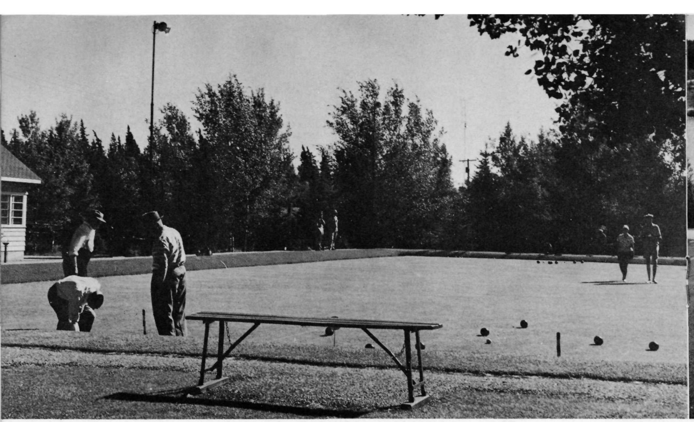
Bowling Green at Wasagaming