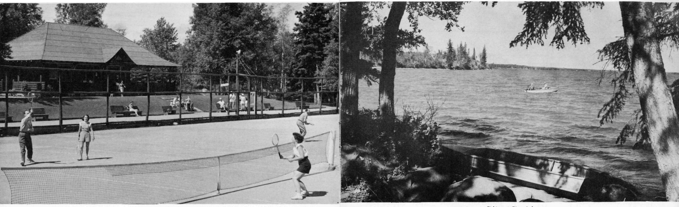
Practising for the Tournament

For visitors travelling with cabin trailers or carrying their own camping equipment there is accommodation in the Government campground. It is situated in a beautiful grove west of the business section of Wasagaming facing Clear Lake, and within easy reach of stores, restaurants, and garages. Camp privileges are available on payment of a small fee, and include the use of a camping lot and community kitchen shelters equipped with stoves, tables, firewood, and running water. Modern toilet buildings are also located in the camp-ground. Convenient taps furnish an ample supply of clear, pure water. Camp-grounds, less completely equipped, are also available at Lake Katherine, Moon Lake, Lake Audy, and Whirlpool Lake.