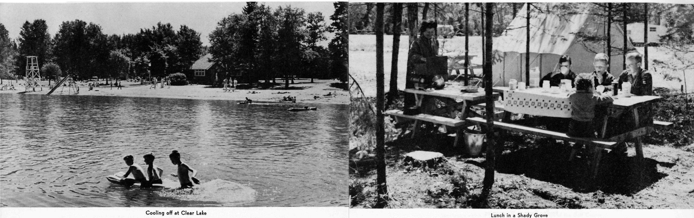
Cooling off at Clear Lake