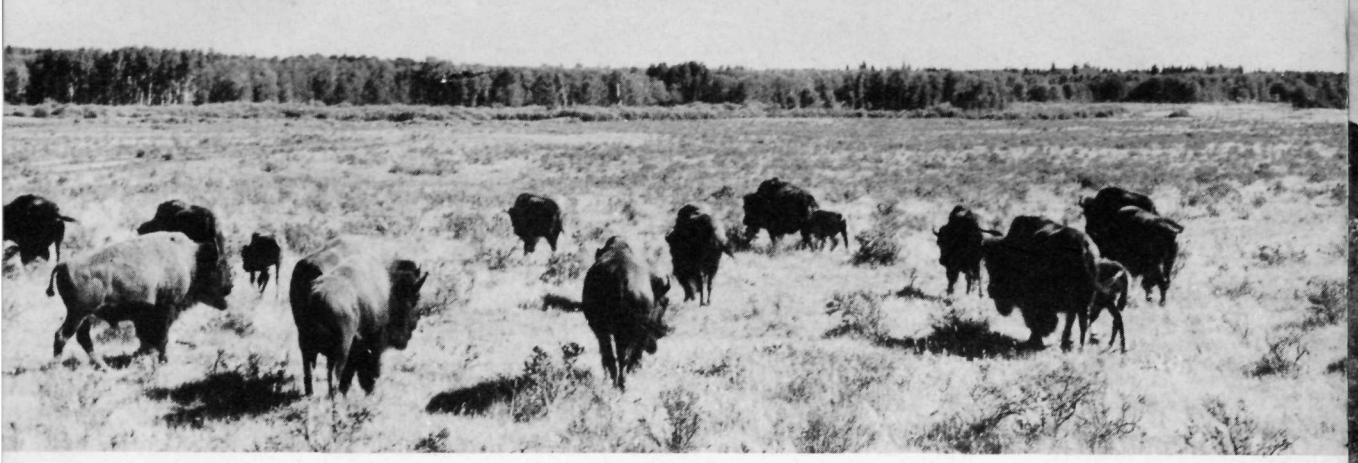
Buffalo near Lake Audy