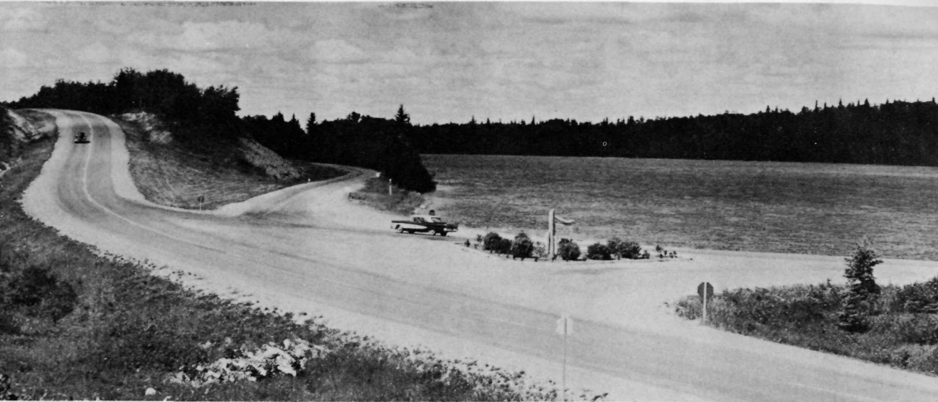
East End of Clear Lake

Issued under the authority of THE HONOURABLE ALVIN HAMILTON, P.C., M.P. Minister of Northern Affairs and National Resources