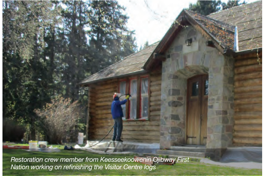
Restoration crew member from Keeseekoowenin Ojibway First Nation working on refinishing the Visitor Centre logs

In the spring of 2019, Parks Canada's fire management team hopes to apply prescribed fire to this area to aid in fuel reduction and grassland restoration.