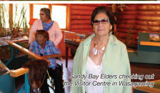
Sandy Bay Elders checking out the Visitor Centre in Wasagaming