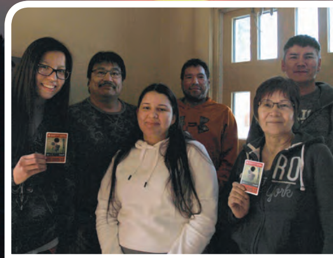
Members of the Sandy Bay First Nation Culture and Language Program with a sample of "Open Door Program" permits.

Pick up your permit — it looks like this!