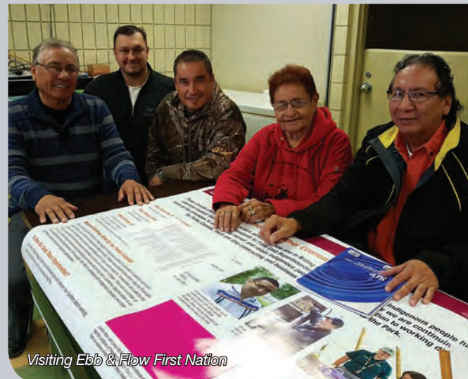
Visiting Ebb & Flow First Nation