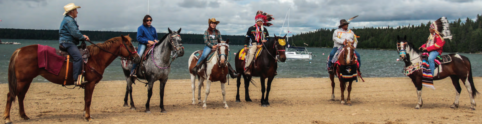
Unity Riders on the Main Beach in Wasagaming National Indigenous Day Celebrations, June 24, 2017