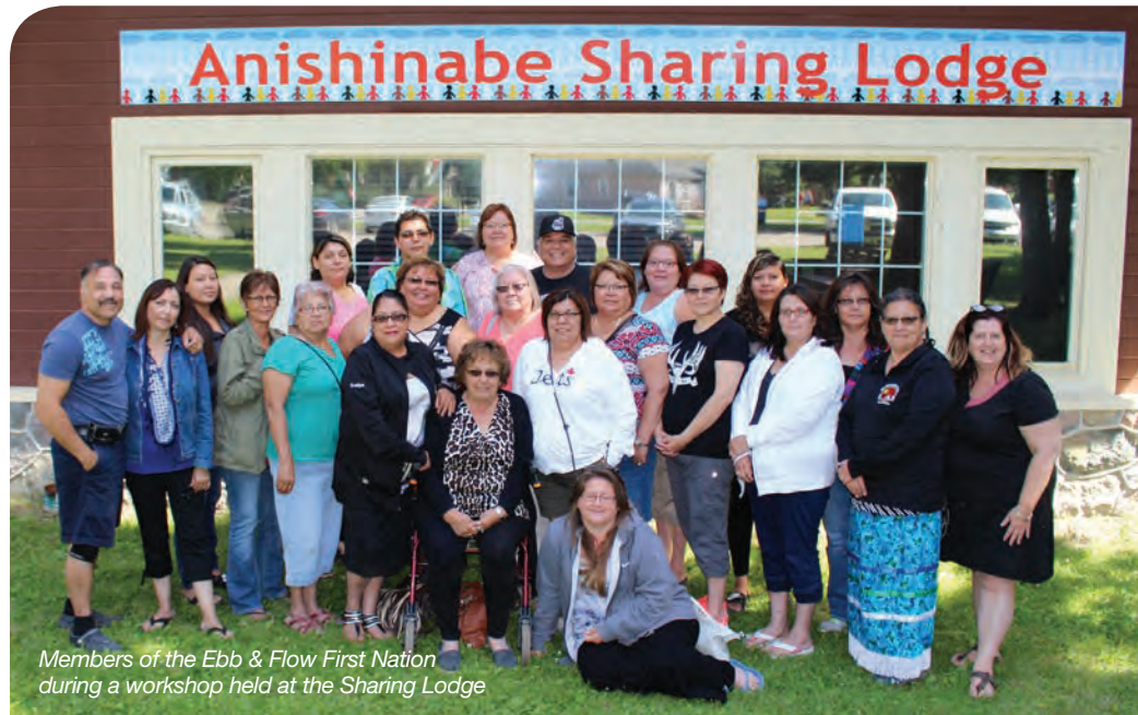
Members of the Ebb & Flow First Nation during a workshop held at the Sharing Lodge

KOFN staff work hard to implement and support special events at the Sharing Lodge including KOFN 61A