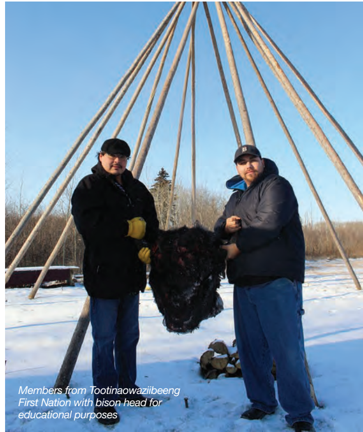
Members from Tootinaowaziibeeng First Nation with bison head for educational purposes