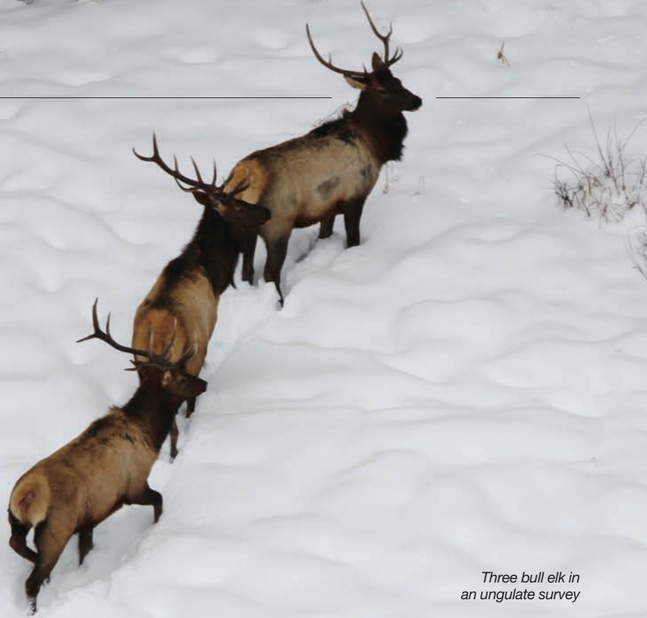
Three bull elk in an ungulate survey

The park recognizes the Anishinabe have traditional connections to the park land and waters. Together we work to protect Riding Mountain National Park.