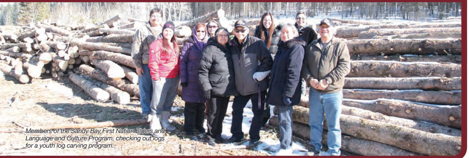
Members of the Sandy Bay First Nation Elders and Language and Culture Program, checking out logs for a youth log carving program.

This opportunity to do specialized work on a Federal Heritage Building, staining it to the high standards of Federal Heritage Building Review Office, creates the chance to develop new skills. As well, it helps preserve the original hand drawn white spruce logs for years to come and represents an achievement we can all take pride in and enjoy.