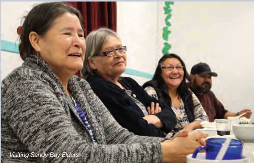
Visiting Sandy Bay Elders

Ideas? Just contact us! See the last page for contact info.