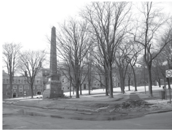
The Governors' Garden

As for the site's other features, the following messages from the integrity statement should be conveyed to the public: the transformation of the upper garden into an urban park in 1838;