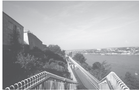
Set between the Citadel and the river, the Governors Promenade offers excellent views

Currently, Dufferin Terrace and Governors Promenade offer visitors an unforgettable experience thanks to their exceptional location and breathtaking panorama. First-hand observation of the Château Saint-Louis archaeological investigations in the company of a friendly and competent guide adds to the memorable experience of visiting the site. Numerous services of interest to visitors are also available from partners year round on the terrace or nearby, making a visit to the site all the more enjoyable. These include the toboggan slide and skating rink in winter, the snackbar and the café, the funicular, and the exchange and tour reservation office. In summer, secondhand booksellers and street musicians add to the site's ambiance.