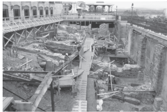
Vestiges of Saint-Louis Fort and Château outbuildings, uncovered beneath the terrace in 1985-1986

Many of these remains have been excavated during archaeological digs undertaken by Parks Canada and the City of Québec since the early 1980s. Until recently, only the funicular terminal beneath the terrace gave an idea as to the lay-out of Château Saint-Louis' cellars. In 2005–2006, other rooms and even the beginnings of vaults were unearthed by archaeologists.