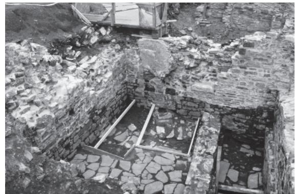
Vestiges of walls of the Saint-Louis Château