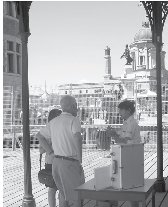
Visitors listening to explanations provided by an interpretive guide posted next to the archaeological site; on the table, artefacts from the site are displayed in a portable case.