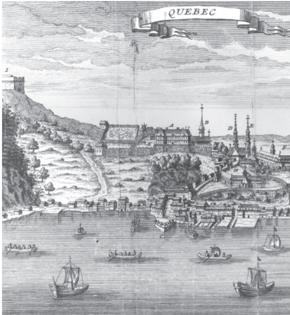
Saint-Louis Fort and Château, Governors' Garden and redoubts of the 1690 fortification, ca 1700

The Governors General of New France, who were both representatives of the King and supreme military and diplomatic leaders in the colony, resided on and ruled from the Saint-Louis Forts and Châteaux site in Québec City. Starting in 1620, four forts were successively built on the site—the first two by Champlain, then representative of the King in New France, and the last two by Governors Montmagny and Frontenac. Champlain lived and died in one of the dwellings he had built on the site. Montmagny then built the first “Château Saint-Louis” and created a garden in the current location of Governors’ Garden. Later, Frontenac built a new château on the site of the Montmagny residence, which had been expanded by his predecessors. In subsequent years, the château—where the governor received seigneurs —continued to be expanded and embellished as outbuildings were added.