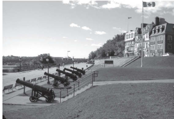
Wolfe Battery, in the Lower Garden Parks Canada, 2001

With its lampposts, six gazebos, and beautiful cast-iron balustrade, Dufferin Terrace is the most popular spot for a stroll in the whole city. From its vantage point above Place-Royale and Petit-Champlain, the terrace offers breathtaking views of the river below, as well