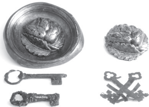
Archaeological objects worth displaying: brass shell-shaped curtain-loop hooks, bit keys, and symbolic ornament made of brass sheets, probably representing a religious authority

the men in power and life at the château. Visitors will hang on every word of a friendly and competent interpretive guide skilled in highlighting the site's heritage values and situating it within the bigger historical picture. Remarkable objects will transport these curious spectators back to the times of the Montmagnys and Dalhousies, as well as their peers and servants. The colonial court will take shape in their head as they glean even more information from the interpretive tools that dot the way. What's more, the site's main commemorative themes will be clearly, effectively, and satisfactorily presented to visitors still moved by their experience but eager to organize and round out their knowledge.