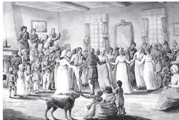
Dancing at the Château C-040 / George Heriot, 1801

After the Conquest, the mandate of the Governors General was modified to include certain duties assigned to the intendant under the French regime and the leadership of the House of Assembly. Fort Saint-Louis lost its military role as it was replaced by other newly constructed defensive works and numerous new service buildings. In the late 1780s, the official governor’s residence was transferred to the new Château Haldimand, opposite Château Saint-Louis. The land south of the fort became an extension of the garden created during the French regime, and was called the lower garden. In 1808, the governor moved back into a completely remodelled Château Saint-Louis and lived there until it was destroyed by fire in 1834. He would continue to hold formal dinners at Château Haldimand until 1838 (Maps 3 and 4).