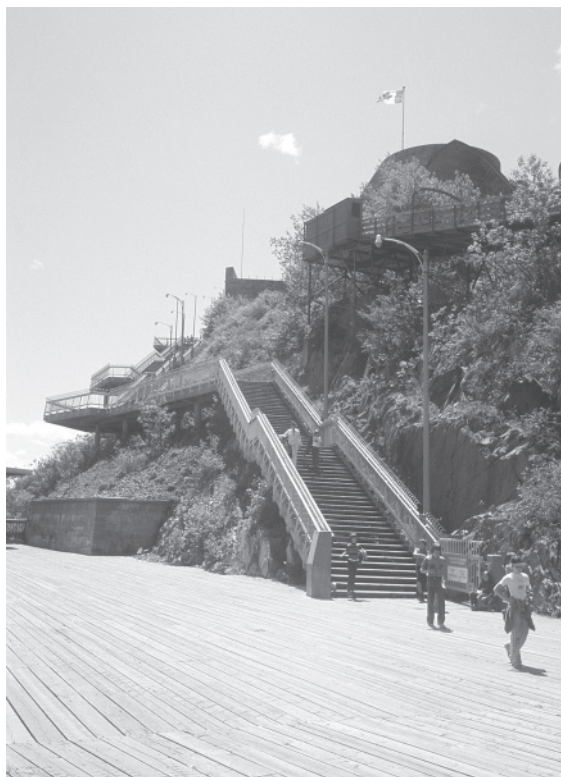
One end of the Governors Promenade, on Dufferin terrace