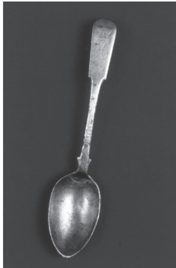
In the archaeological collection: a small silver spoon manufactured in 1818-1819, bearing a monogram (the letter "D") surmounted by the crown of an English Earl (the Earl of Dalhousie ?)

Lastly, around 100 artificats and ecofacts were unearthed by the City of Québec in the 1980s in the fort's northwest bastion where the UNESCO monument now stands. They mostly comprise food and construction materials, but also bear witness to tobacco use and clothing. Around half of the objects predate 1760; the other half being deposited some time after 1776.