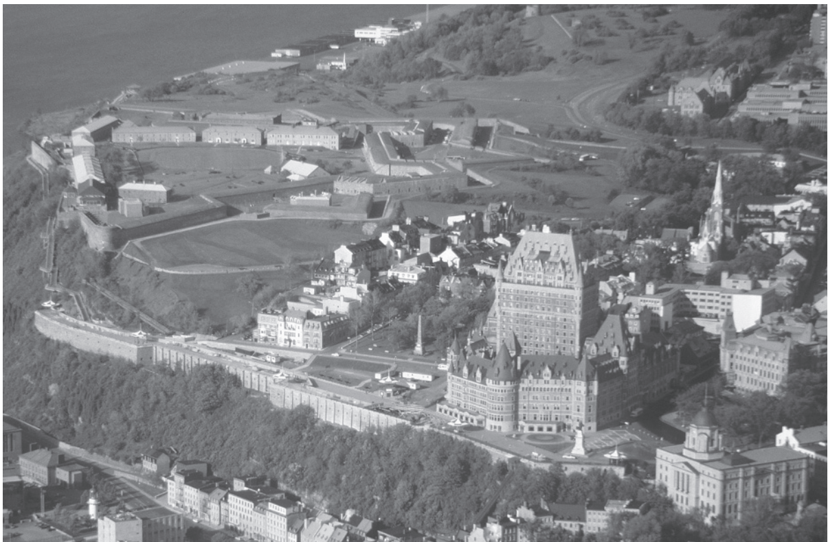
Aerial view of Saint-Louis Forts and Châteaux National Historic Site of Canada

Once reviewed by the national office, it was certified by the Chief Executive Officer of the Agency, approved by the Minister of the Environment, and tabled in Parliament. In accordance with the provisions of section 32.(2) of the Parks Canada Agency Act , the plan will be reviewed in 2011.