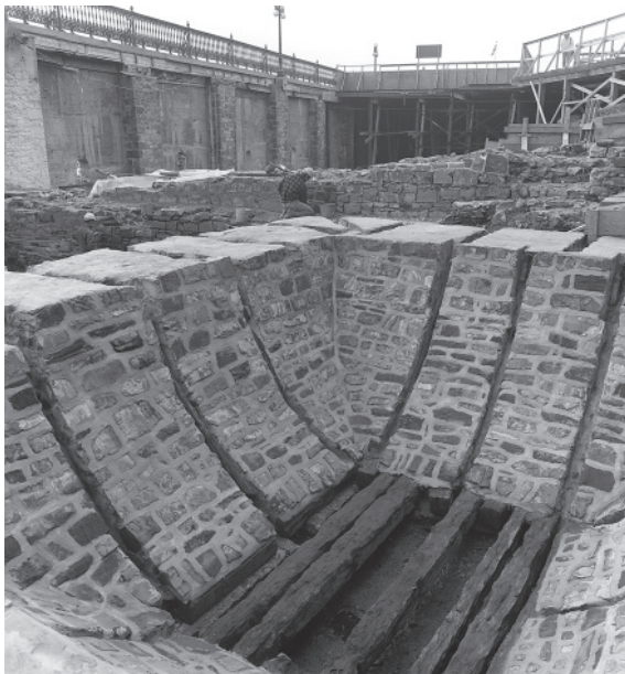
Vestiges of the Château icehouse; when it was in use, this large reservoir for storing ice was topped by a cold chamber.

The challenge therefore consists of ensuring that commemorative messages are effectively conveyed on site by making full use of the resources that characterize the site and by drawing on a sufficient understanding of history.