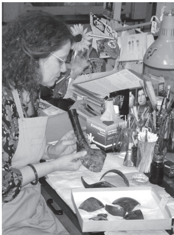
Restoration work on a “wine” bottle, probably of French origin and from the end of the 17th century, found in latrines

Artifacts from the first half of the 17th century bear witness to the time when Champlain moved to the top of the cliff and perhaps the 1629–1632 occupation of the city by the Kirke brothers. The sector beneath the Frontenac