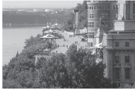
Dufferin terrace's privileged location

In this magnificent, meaning-laden context, a short list of the Old City's standout monuments necessarily includes the Citadel, the fortified walls and stone gates, the Château Frontenac, and Dufferin Terrace. The historic district, proclaimed a world heritage site by UNESCO in 1985, is a prestigious historical, cultural, and heritage site. Major events thrust the French-speaking and English-speaking populations that followed one another into the spotlight. There are numerous remains that bear witness to the roles of trading post, port of entry, fortified city, colonial capital, garrison town, and principal ecclesiastical seat that Québec City played from the time of its founding to the middle of the 19th century. This is undoubtedly why it is the most visited part of the City of Québec and one of the best-known historic districts in Canada.