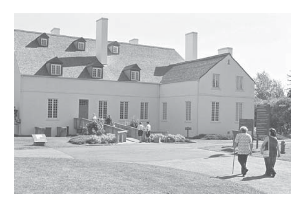
Reconstruction of the exterior of the Grande Maison Parks Canada / E. Kedl