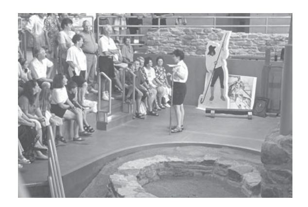
An interpretation activity inside the symbolic structure of the blast furnace

A guided tour of the historic site is the ideal way for visitors to learn about the site. It starts near the Grande Maison. The interpretive guide begins by outlining the main periods in the history of the Forges, the products manufactured and the role of the stream in providing hydraulic power. Referring to the presence of archaeological remains, the guide explains the existence of workers' dwellings. He/she explains how symbolic structures are used as an interpretation tool to recreate the ambience of the industrial operations that took place at the blast furnace, and describes the blast furnace and the complex of buildings that once surrounded it. The guide talks of how the ironworks produced, over more than 150 years, thousands of tons of cast iron for moulded objects and ironwares. Inside the symbolic structure housing the blast furnace, he/she comments on the displays illustrating the extraction, transport and dressing of the raw materials needed to produce cast iron. The guide explains how the blast furnace and the bellows worked, the production of cast iron and the way it was moulded in sand. He/she explains how the great wheel outside is activated by water power supplied by the stream. The guide takes visitors down the path