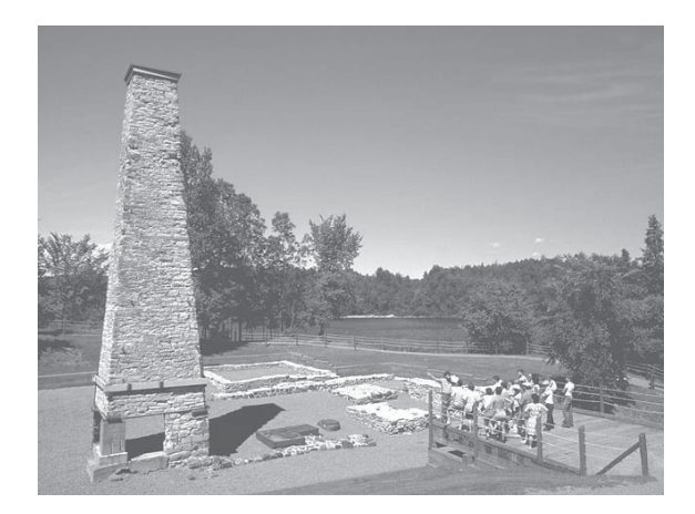
An interpretive guide explains the remains of the lower forge chimney to visitors

modest ironworks built by Francheville (1733-1734) and the European-style ironworks consisting of a blast furnace and forge, built by ironmaster Olivier de Vézin in 1736. The imposing ruins of the chimney still standing is the only one in Canada to attest to the use of 18th century Franche-Comté type chaferies.