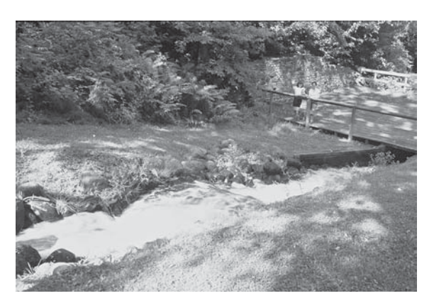
The Forges Stream near the remains of a mill

elements that are still visible today. These landscape features, which evoke the history of the Forges, do not appear to be threatened, but few messages of their historical value are currently being conveyed. Several years ago, the period landscape was the subject of studies and proposals as to how it should be developed, but to date no specific interventions have taken place. Before the CIS was drawn up, cultural landscapes were not considered to be cultural resources. Their presentation and the communication of their historical value must now be reconsidered.