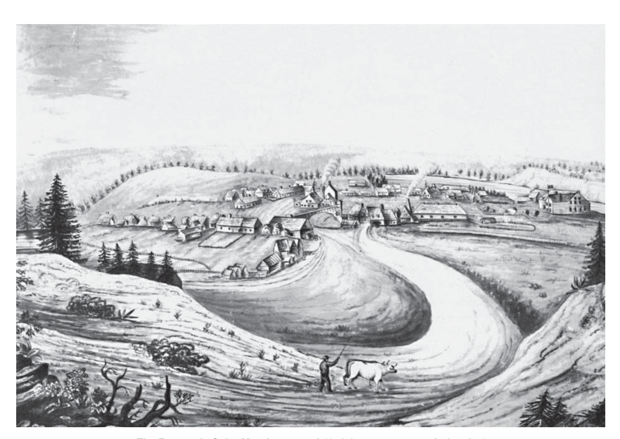
The Forges du Saint-Maurice around 1840 (anonymous wash drawing)

These values are resource-related – historical values and messages that, while not recognized as having national importance, are historically meaningful. These other heritage values correspond to archaeological collections and sites that must be preserved and messages that should be conveyed in the form of additional information.