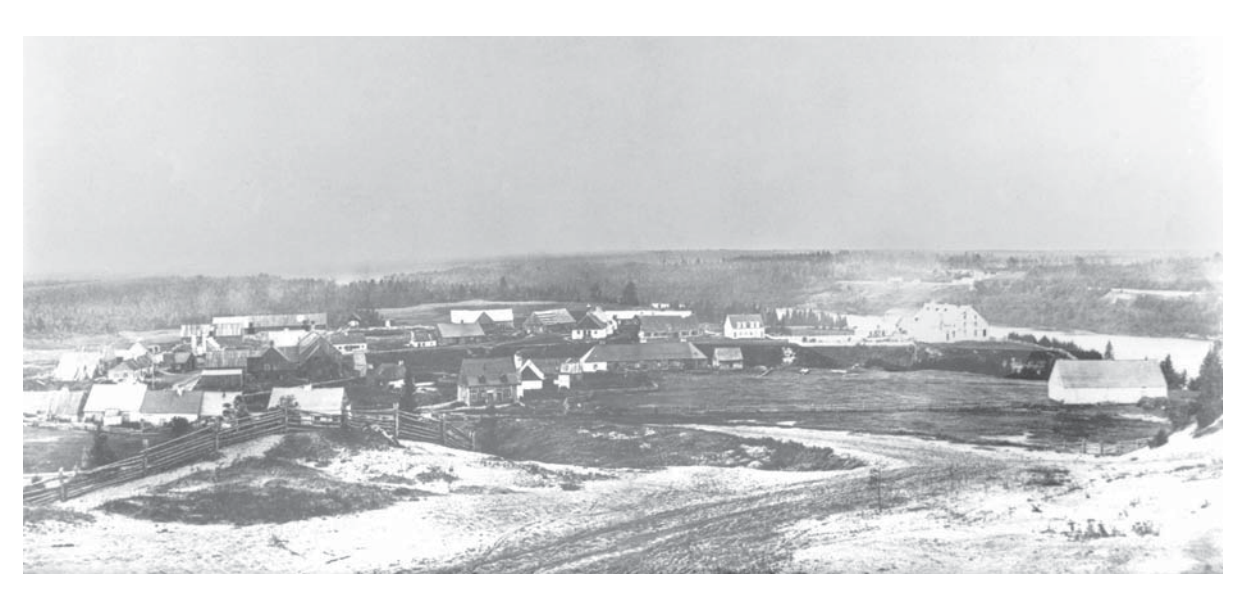
The Forges du Saint-Maurice around 1870 as the site appeared to visitors from Trois-Rivières Library and Archives Canada, PA-135-001 / J. Henderson