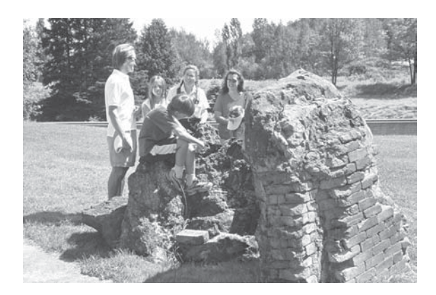
Interpretation activities, with part of the Forges landscape in the background

the river bank. The area where the "devil's fountain" is located still appears to be vulnerable to erosion. This is being monitored on yearly basis.