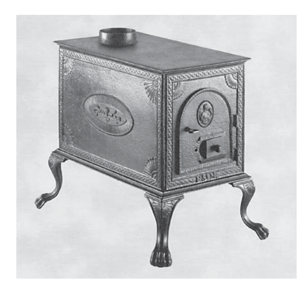
Woodstove made at the Forges du Saint-Maurice