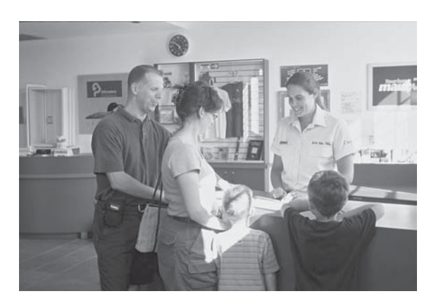
A guide greeting visitors

with the history of the Forges. They can follow a path, along which are various interpretation panels explaining the remains of the village and ironworks and the natural features that led to the establishment of an industrial community in this location. Guided tours and interpretation activities designed for a range of audiences complete the information conveyed to visitors.