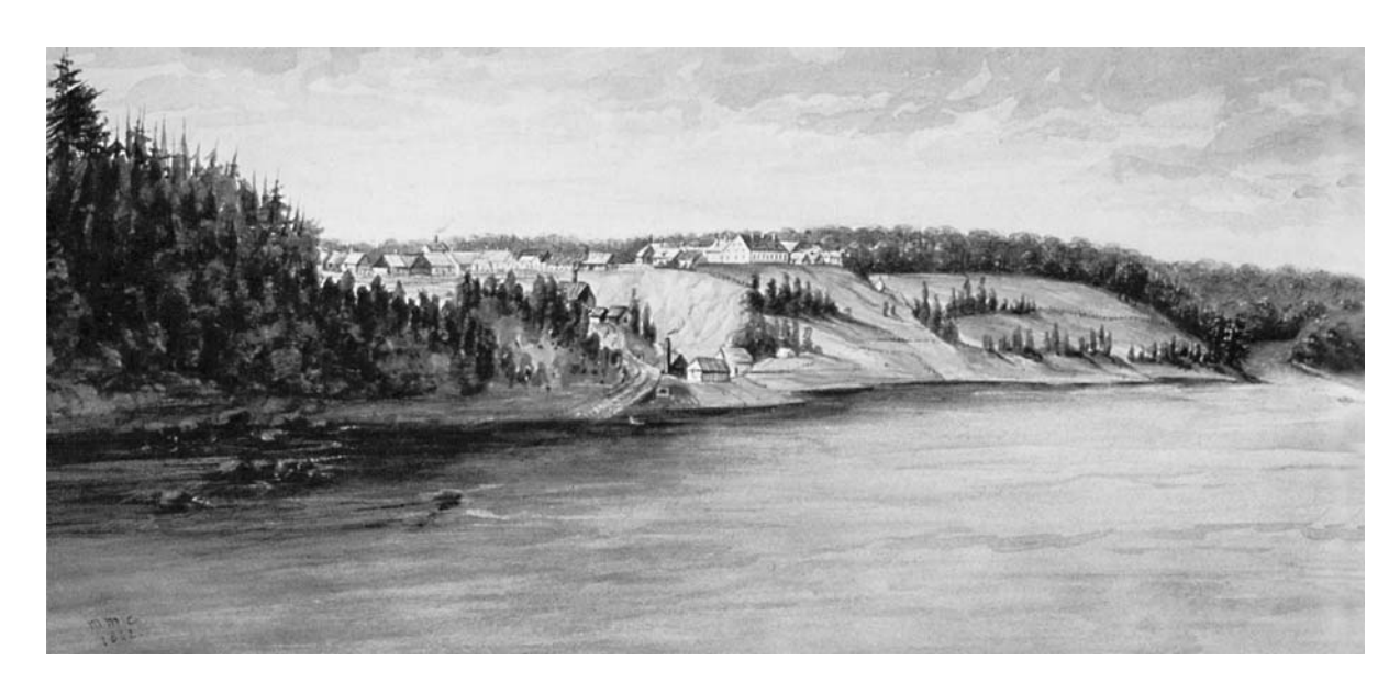
The Forges on the St. Maurice River, by M. M. Chaplin, 1842

During the colonial era, the Forges were known for the quality and variety of its products, in particular its stoves, which were very popular among the habitants . In addition, the special status held by the Forges as a Crown operation made it the only ironworks in Canada for over a century and a key player in the economic history of the country.