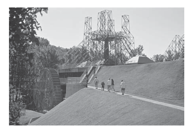
Symbolic structure housing the remains of the blast furnace