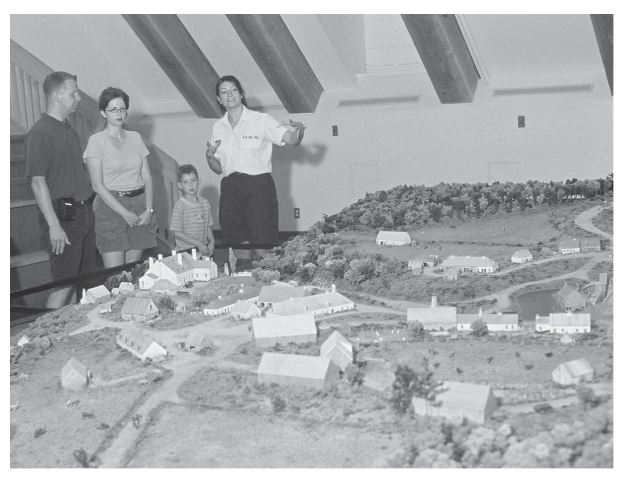
Guide presenting the historical scale model situated inside the Grande Maison

The space inside the blast furnace interpretation centre is organized according to how this complex was used historically: the charcoal house, bellows shed, casting house, moulding shop, oven and founder's living quarters. The exhibits have been developed based on these historical functions: