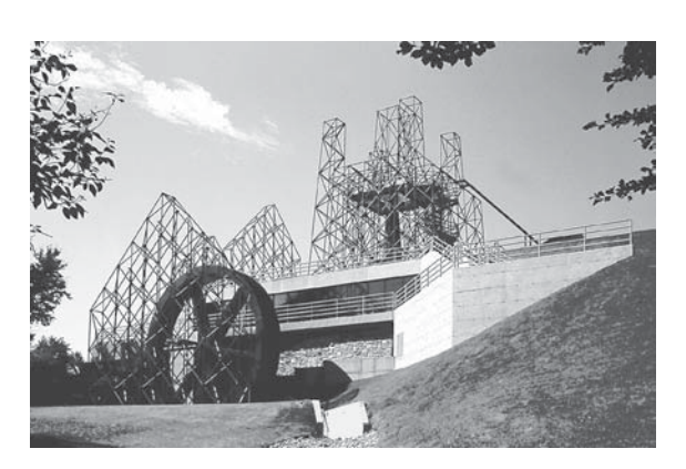
Symbolic structure of the blast furnace

The diagnostic study therefore concluded that a major revamping of the exhibits at the blast furnace is required, and the sound and light show needs to be reviewed based on the comments received. In the meantime, explanations given in the guided tour fill in the gaps identified in the visitors' understanding of the organization and operation of the blast furnace.