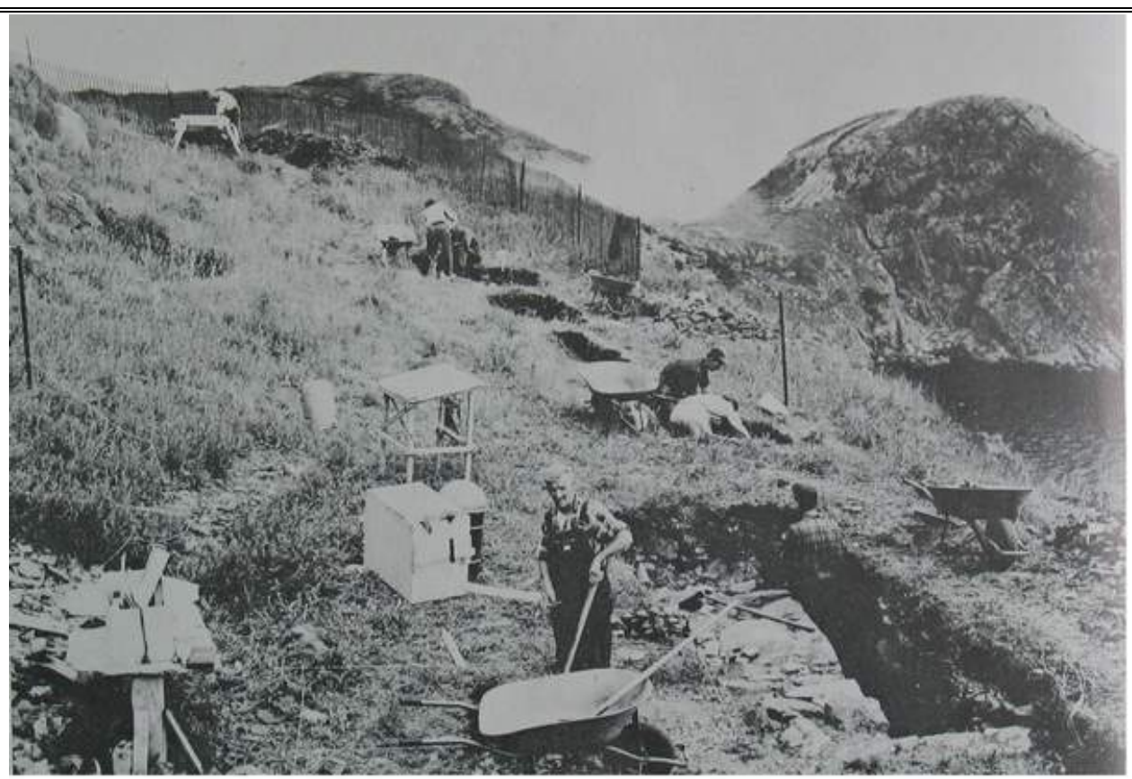
Figure 9 Workers excavating at Ladies Lookout in 1966 (From Jelks 1973) (Mills)