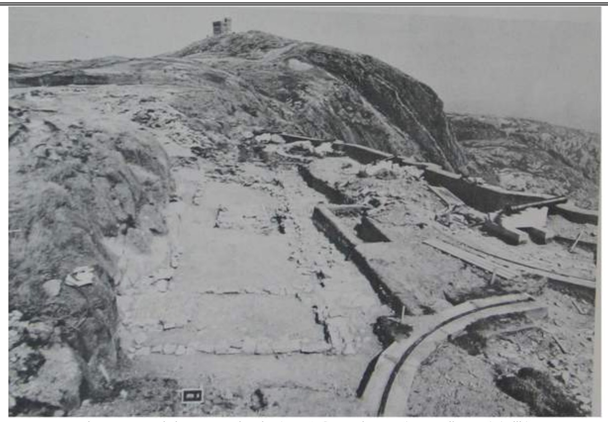
Figure 11 Foundations exposed at the Queen's Battery in 1966 (From Jelks 1973) (Mills)