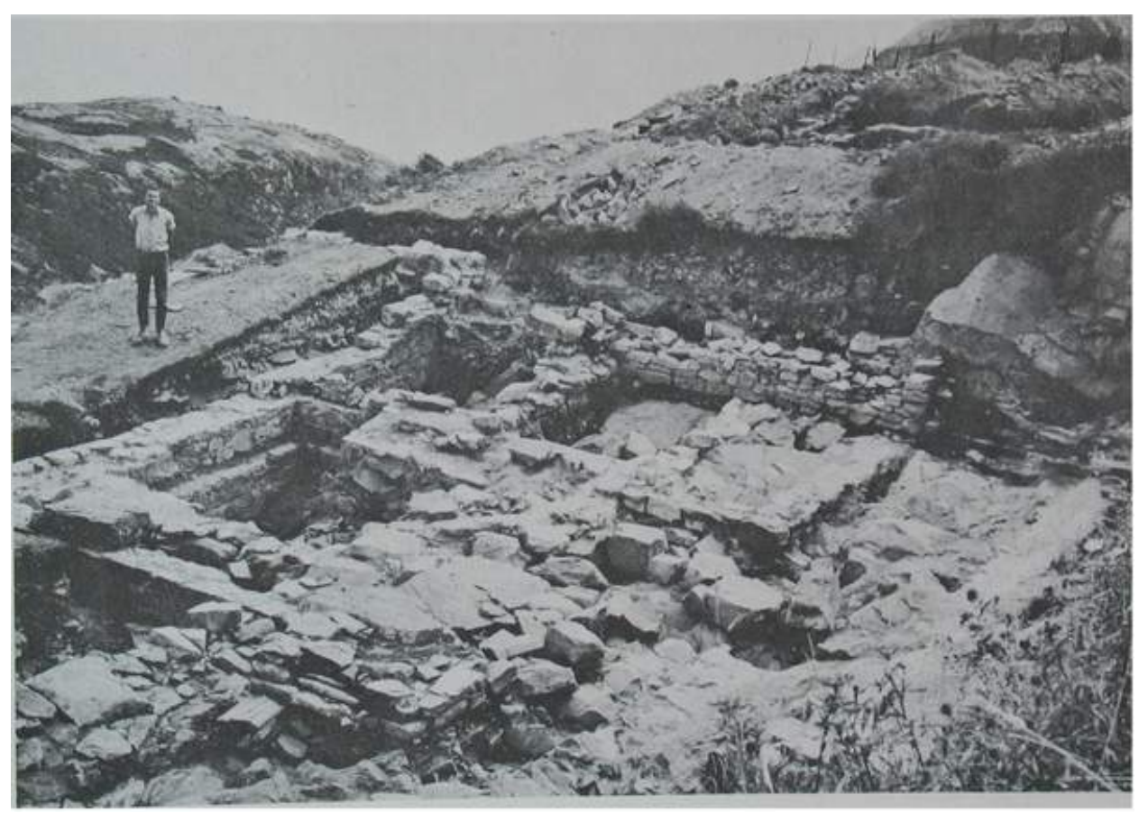
Figure 10 Archaeologist Edward Jelks standing by the excavated ruins of the 1835 canteen at Ladies Lookout in 1966. (From Jelks 1973) (Mills)