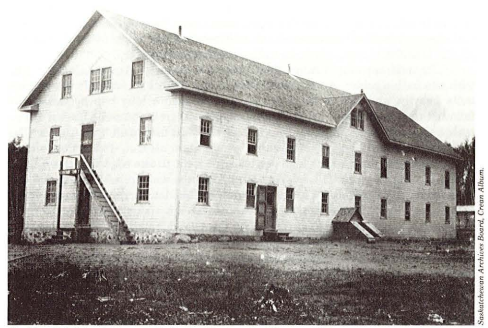
Residential School, Roman Catholic Mission, La Plonge, 1908.