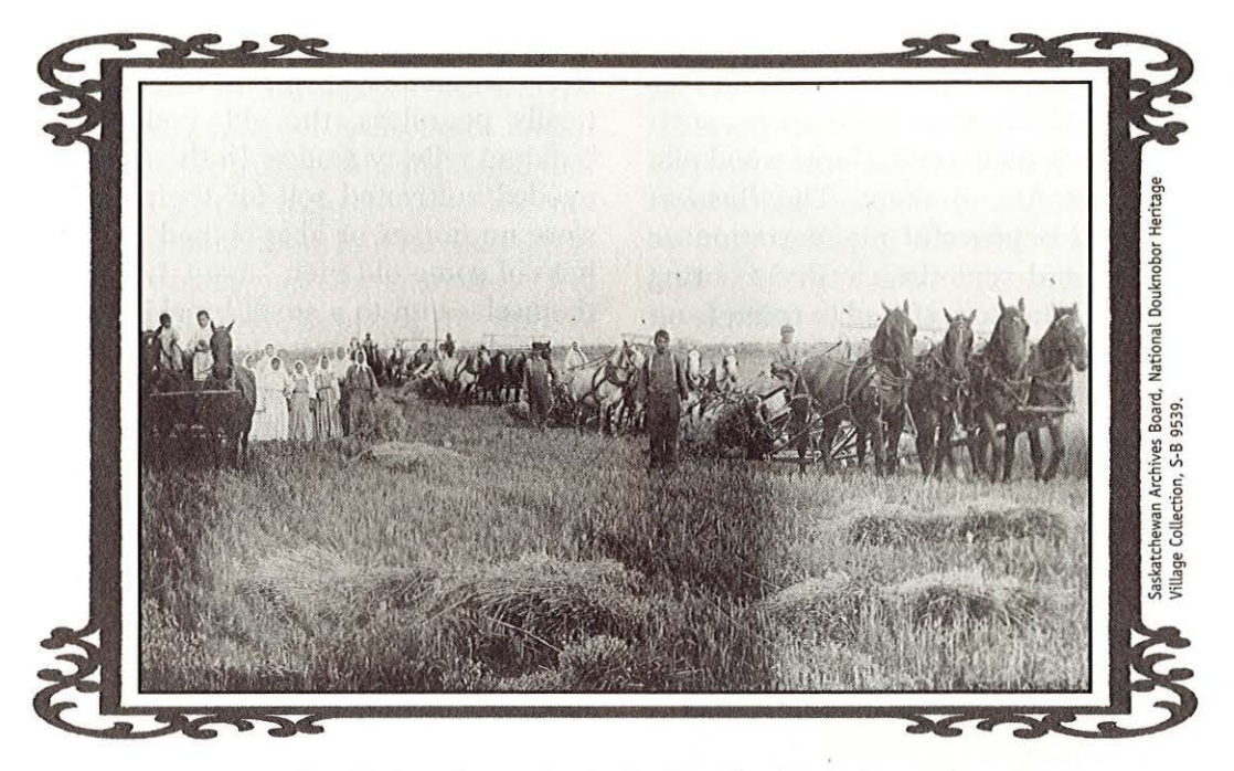
Community Doukhobors harvesting in Section 13 with mechanical machinery near Verigin in 1917.

gin forests in the Kootenay valley and develop their thriving enterprises such as sawmills, brick factories, fruit orchards and a world renowned jam factory. They even built a steel bridge across the Kootenay River which was used by the general public for many years until the B.C. government had to build a bigger bridge to accommodate higher volumes of traffic. The old bridge is now a heritage site. The Doukhobors were enjoying freedom, prosperity and a good quality of life not realizing that all was not as well as it appeared on the surface. These were thriving communal village enterprises; they were not 'Communist.' However, since the Doukhobors maintained their communications with their Russian friends and relatives in Russia, by then a Communist State, the Canadian government was becoming disturbed by this chain of events.