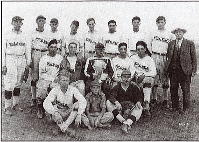
Photograph by Leonard A. Hillyard.

Courtesy of the Saskatoon Public Library - Local History Room, LH 4472.