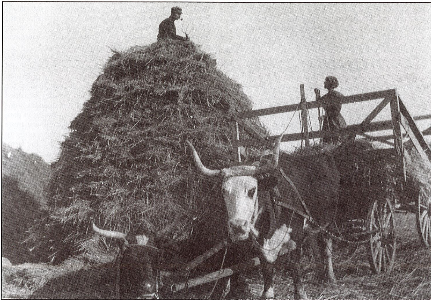
Courtesy of the Saskatoon Public Library - Local History Room, PH 93-171.

Simply to make the land black and put the seed into