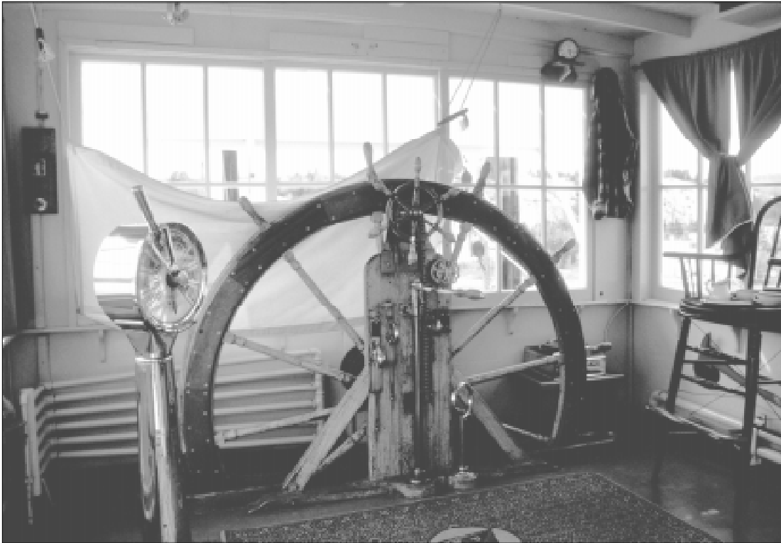
The wheelhouse of the S.S. Klondike is a highlight of the visitor's tour of the restored vessel. PC