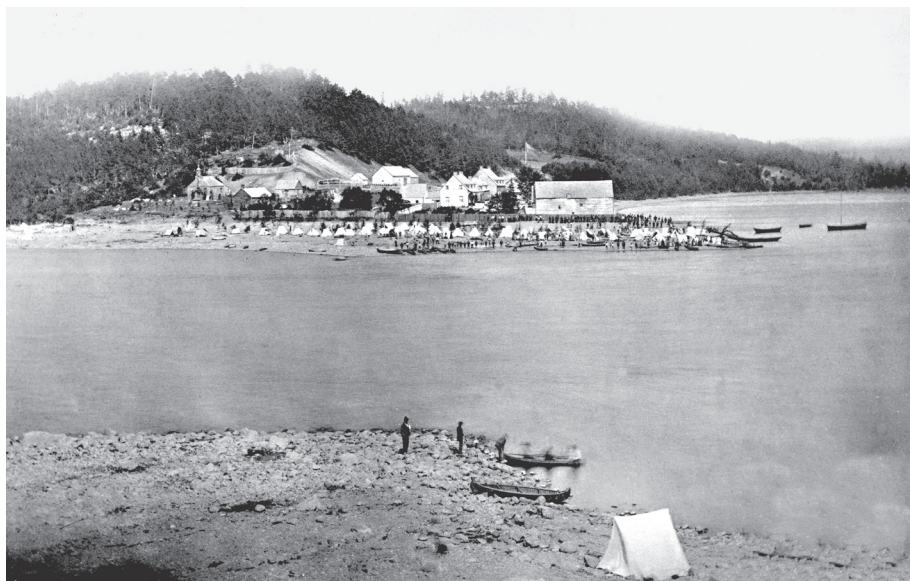
Fort Témiscamingue, 1876