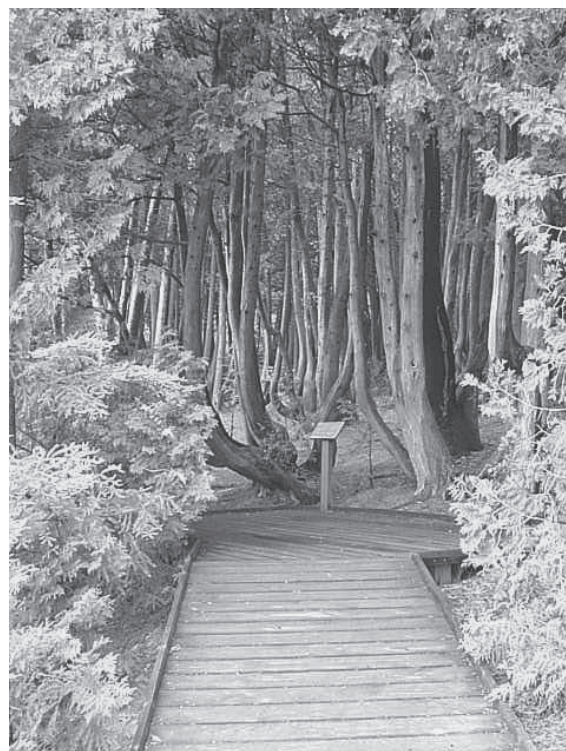
The "enchanted forest"

More than 80% of the total site area is covered by woodland, including 20 different forest stands. As a result of past harvesting, the red and white pines that used to populate