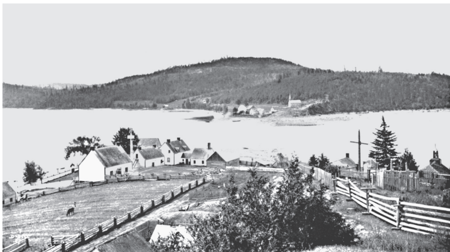
Fort Témiscamingue. View from the north-east, 1887 Library and Archives Canada, PA 163895 / D. Bell

The Fort Témiscamingue National Historic Site is located in the town of Duhamel-Ouest in Abitibi-Témiscamingue on a 27 hectare piece of land that juts into Lake Temiscaming where it narrows. Several landscape features and a considerable number of archaeological resources, both visible and buried, provide evidence of the site's successive occupations.