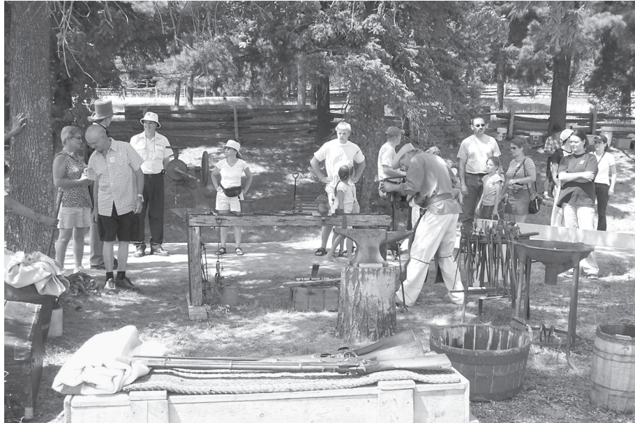
Special visitor activities Parks Canada

site's efforts to promote itself. Some 800 Abitibi-Témiscamingue and northeastern Ontario teachers are sent materials each year about the services offered for primary school students.