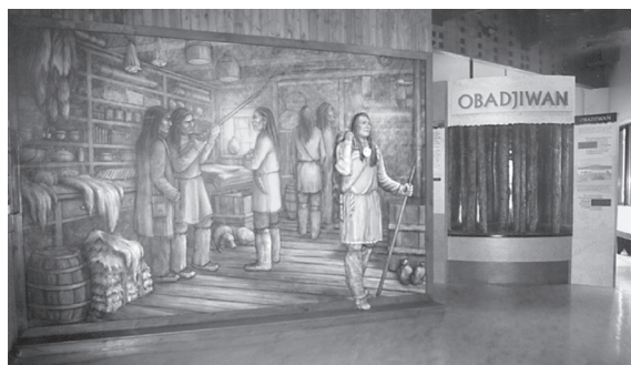
Reception and interpretation centre, interpretation modules