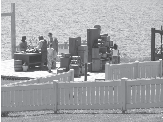
Store interpretative node

complete with shelves of goods and a large representation depicting the Anishnabe trading in the company store. A small gift shop is housed there. Visitors are then invited to explore the exhibit room, which tells the story, in highlights, of the site's history. They are especially encouraged to view the 3D model, which gives them an idea of the fort's composition in 1880 during the Hudson's Bay Company era. The model helps visitors understand the spatial layout of the discovery trail on the fort grounds. They can join a group for a guided tour or go to a point on the outdoor trail to begin a self-guided tour.