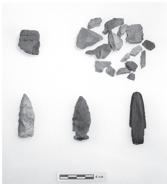
Objects and lithic material of aboriginal origin found during archaeological investigations.