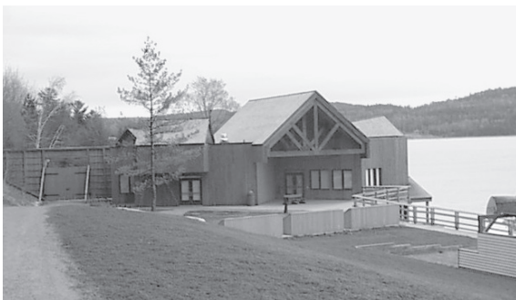
Reception and interpretation centre, exterior

First of all, the new visitor and interpretation centre, which opened in 2000, evokes the past by simulating a fort: several roofs seem to rise above a long palisade, as if there were several buildings. The centre’s design was