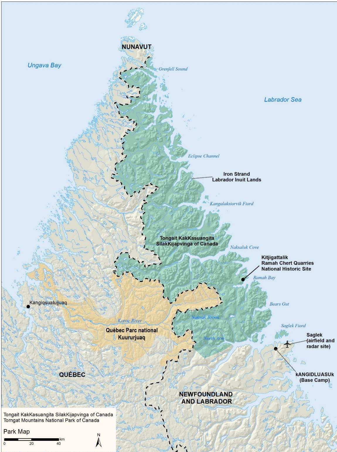
Map 1 Park Map