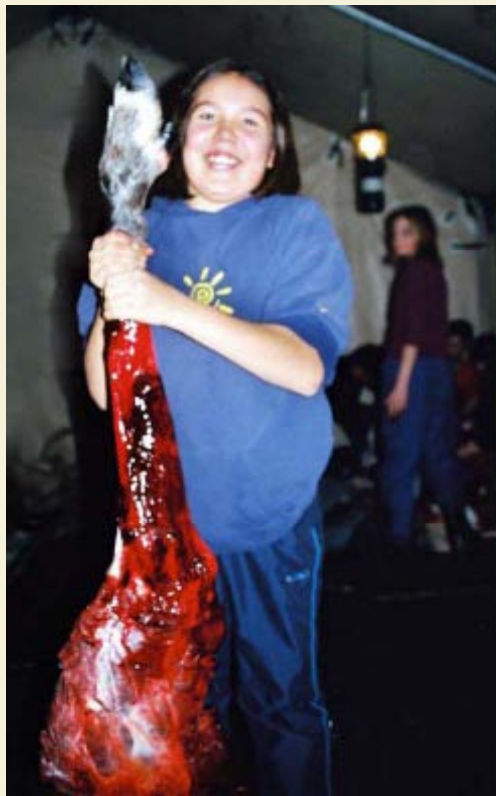
Tr'ondëk Hwëch'in youth at the annual "First Hunt" ceremony, fall, 2003.

In 1825-26 a Royal Navy exploration program, the Beechey-Belcher Expedition, travelled along the north slope of what would become Alaska and the Yukon, a region previously unknown to Europeans. The expedition stopped at a number of camps along the coast and visited with the Indigenous peoples attempting to learn what they could of the land they were entering. During these stops they traded for items that served as markers of their journey.