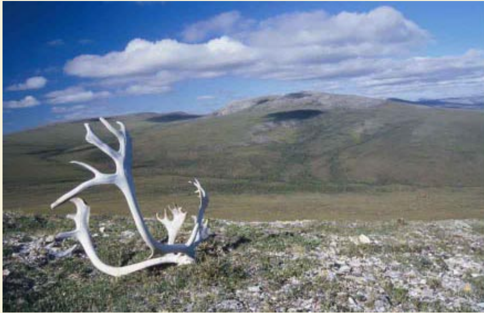
Vuntut National Park of Canada protects a portion of the range of the Porcupine Caribou Herd.