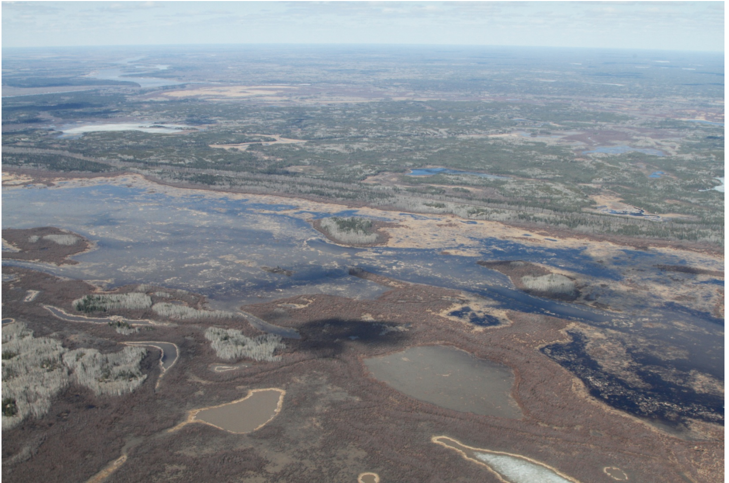
Figure 7 – Flood water in Egg Lake (58.8963°N, -111.4228°W). Photo taken soon after flood (May 15, 2014).

From about May 7-10 there was an ice jam on the Quatre Fourches channel, in the area west of Pushup Lake (see map - Appendix I. Head: 58.8424°N, -111.5761°W; Toe: 58.7925°N, -111.5314°W). This caused flooding of channels that feed a number of basins in the vicinity of Pushup Lake, and eventually Egg Lake (Figure 7).