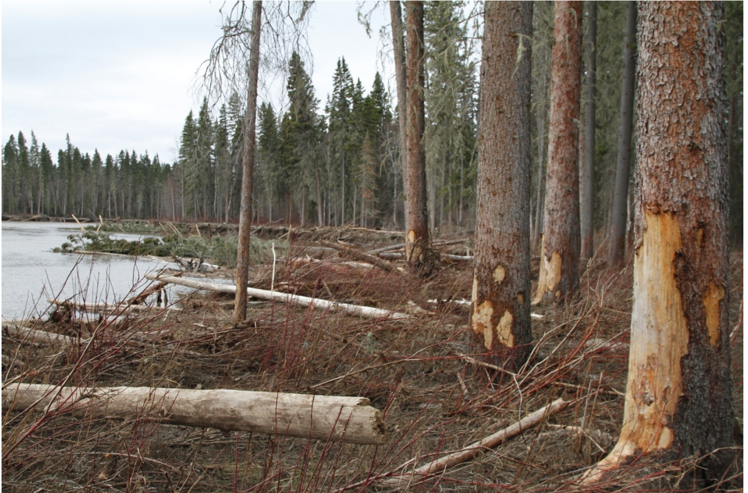
Figure 9 – Severe ice-scarring on mature spruce at the cutoff of Mamawi Creek from the Embarras. There was also extensive erosion and deposition of fresh sediment over this bank (east bank of Mamawi Creek)