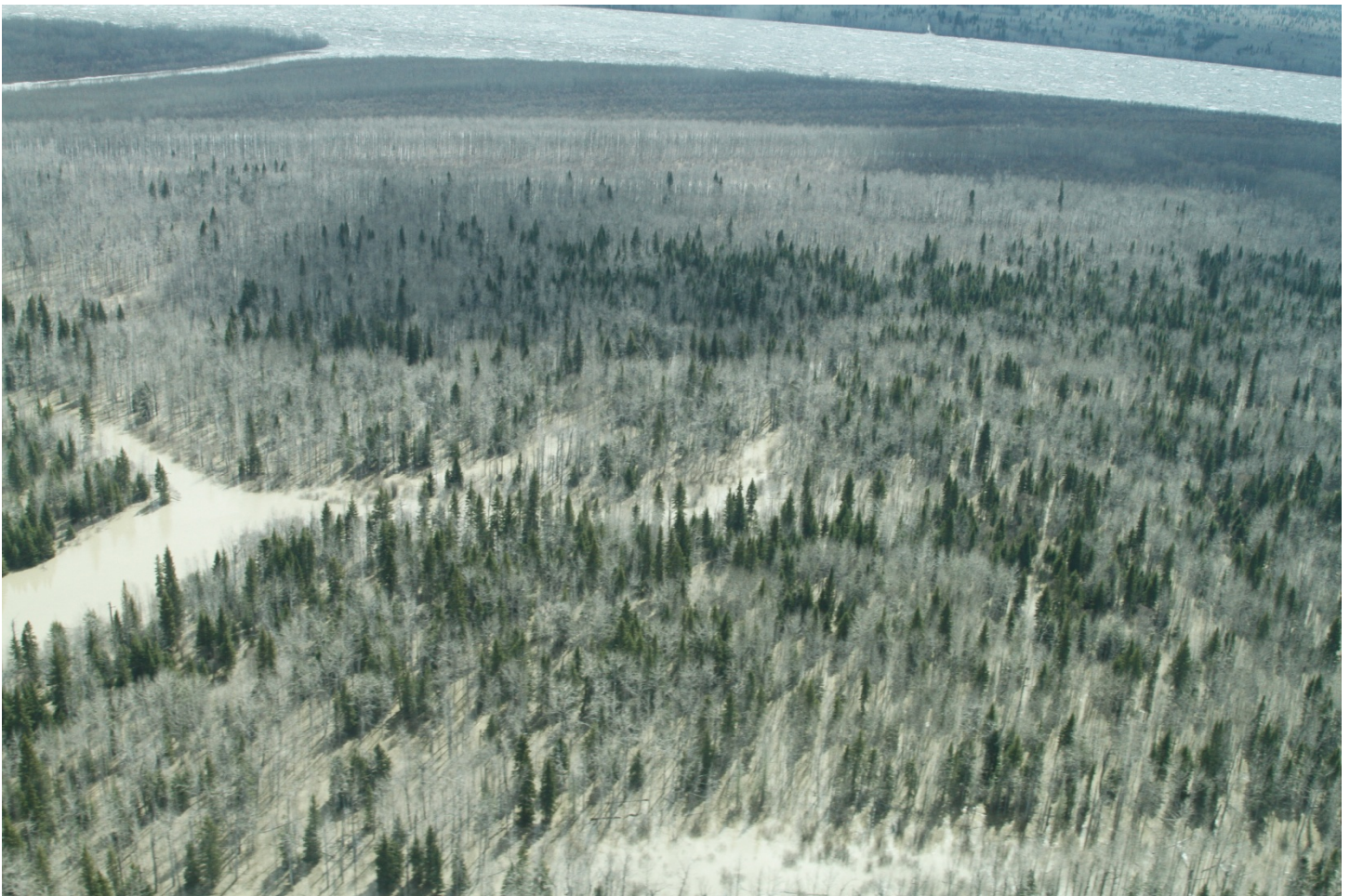
Figure 2 – Overbank flooding on north side of the Peace River (58.943158°N, -111.896172°W) near Sweetgrass Landing (May 6, 2014).

The water level rose an estimated 6 metres on parts of the Peace downstream of Garden River, in the areas around Peace Point (59.1237°N, -112.4479°W) and Sweetgrass Landing (58.9280°N, -111.9265°W). Maximum water levels probably occurred around May 5-6, while a large ice jam was in place between Burnt Thumb (59.005486°N, -112.062549°W) on the Peace, and 30 th Baseline (59.075086°N, -111.419856°W) on the Slave. Many islands were inundated, as were low-lying areas within the floodplain (Figure 2).