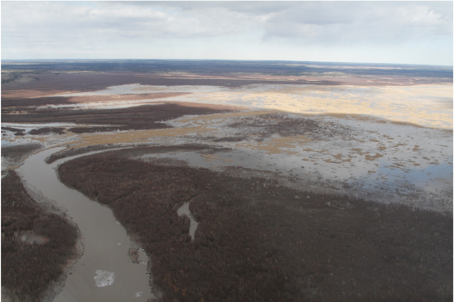
Figure 6 - Flood waters from Peace River flowing into north end of Baril Lake (58.800464°N, -111.688498°W) via Baril River (May 6, 2014)

When the flood was at its peak, most of the major channels south of the Peace (Sweetgrass River, Claire River/Pine Channel, Baril River) began flowing rapidly, eventually carrying flood water as far as the north end of Lake Claire, Lake Mamawi, and Baril Lake (Figure 6).