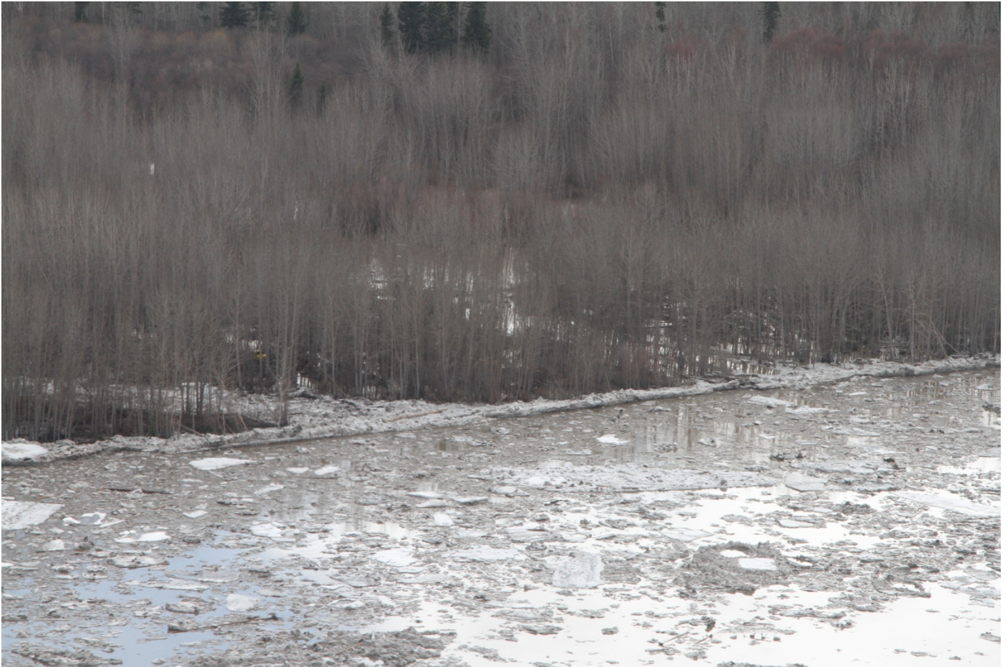
Figure 5 - Overbank flooding at Sweetgrass Landing (May 6, 2014)