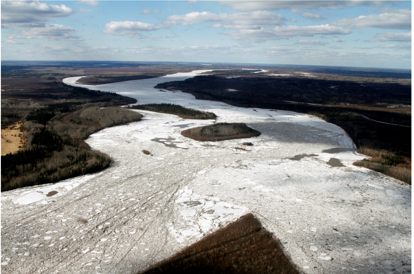
Figure 10 - Toe of ice jam on Slave River (May 6, 2014). Sheet ice visible on either side of island.

Where the Slave meets the Rocher, water levels rose about 4 m at times, with one maximum around May 1, and a second around May 5. Though water was high, we did not observe extensive overbank flooding along the Slave, and most of the flooding occurred further upstream on the Peace.