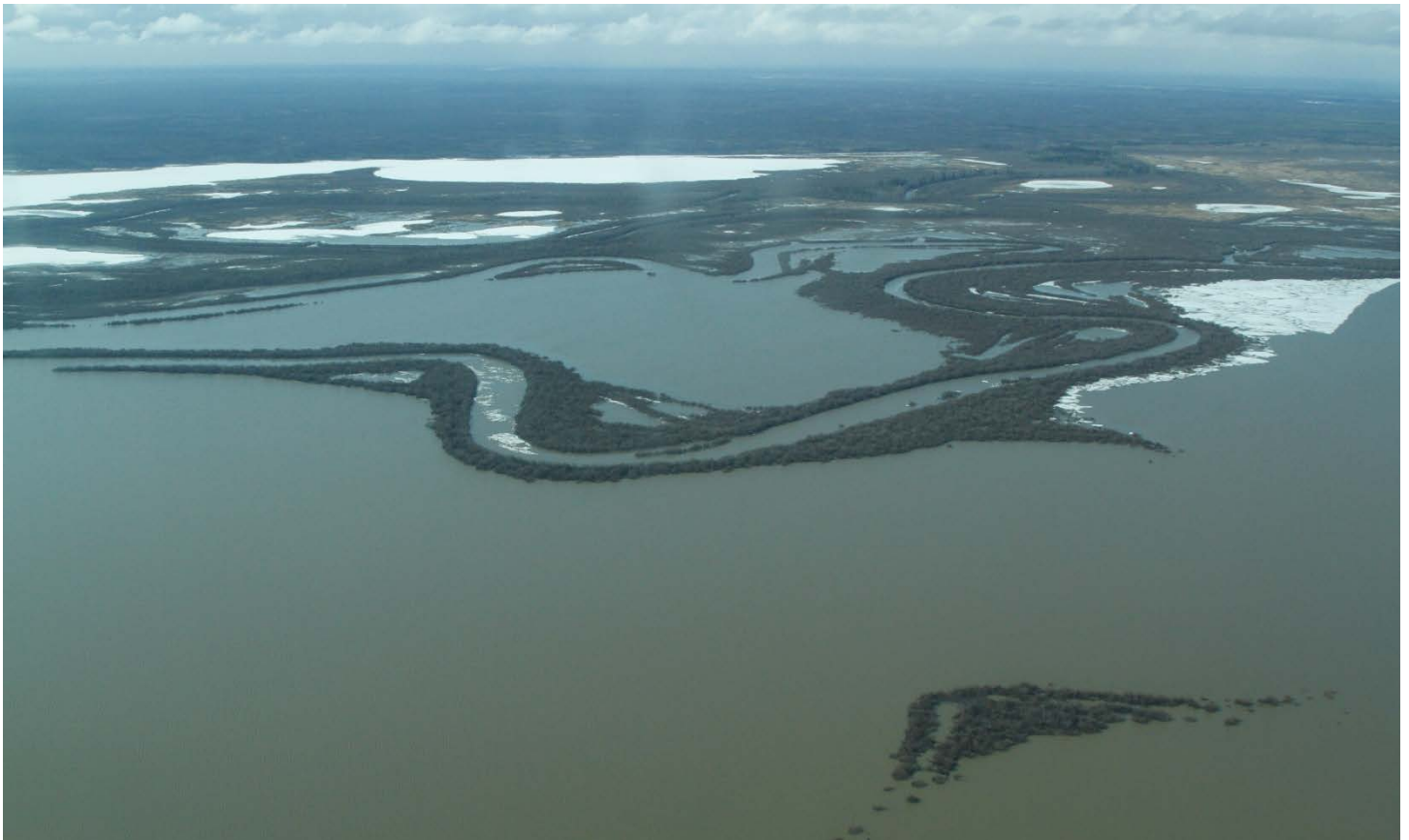
Figure 8 – Flooding at Limon Lake, looking south from the Athabasca River (May 4, 2014).

Flooding was observed south of the Athabasca River as far as Limon Lake (58.420934°N, -111.351317°W) and Blanche Lake (58.389088°N, -111.302747°W) (Figure 8).