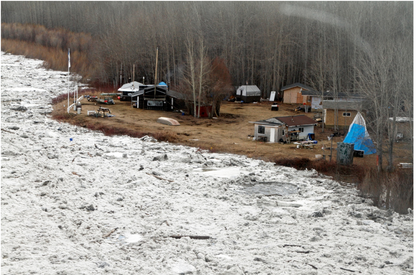
Figure 3 - Water level approaching bank at Rocky Point (58.916183°N, -111.594057°W) on the Peace River (16:00 on May 6 th , 2014).

Cabins at Peace Point, Carlson's Landing, and Moose Island were not flooded, but water came within about 1 m of breaching the bank at Rocky Point (Figure 3), and reached some cabins downstream of Rocky Point.