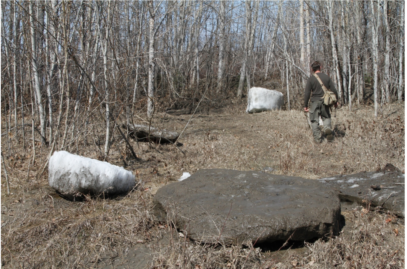
Figure 4 – Ice and sediment deposited by overbank flooding at Sweetgrass Landing (photo taken post-flood: May 14, 2014).

Water breached the north and south banks of the Peace River in several areas – particularly around Sweetgrass Landing (Figures 4-5).