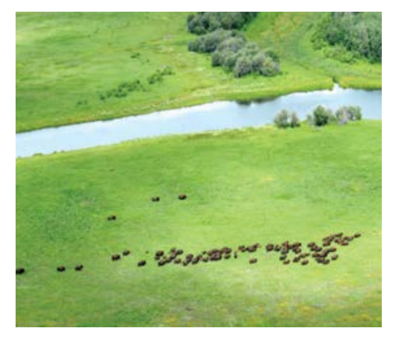
Bison on the delta of the Peace and Athabasca Rivers.