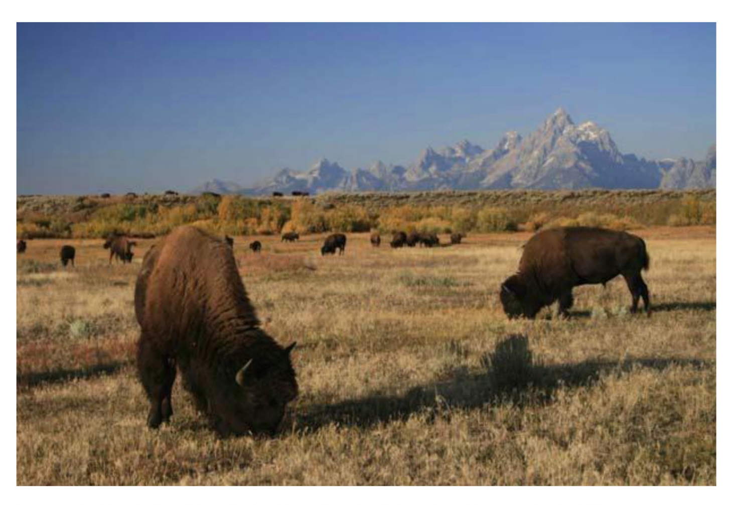
Free-roaming bison in Grand Teton National Park, Wyoming. This herd provides exceptional wildlife viewing within the park, and hunting opportunities on adjacent lands.